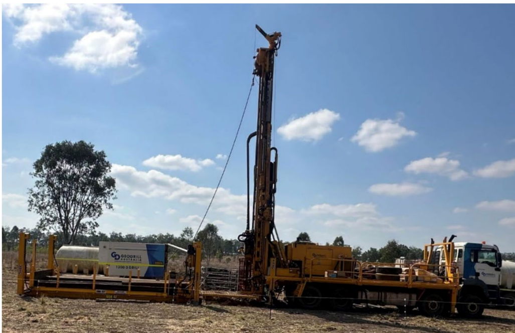
Figure 4: Drilling rig on site at the Rolleston South Coal

These results validated and, in some areas, exceeded the existing geological model, materially reducing geological risk across the drilled areas.