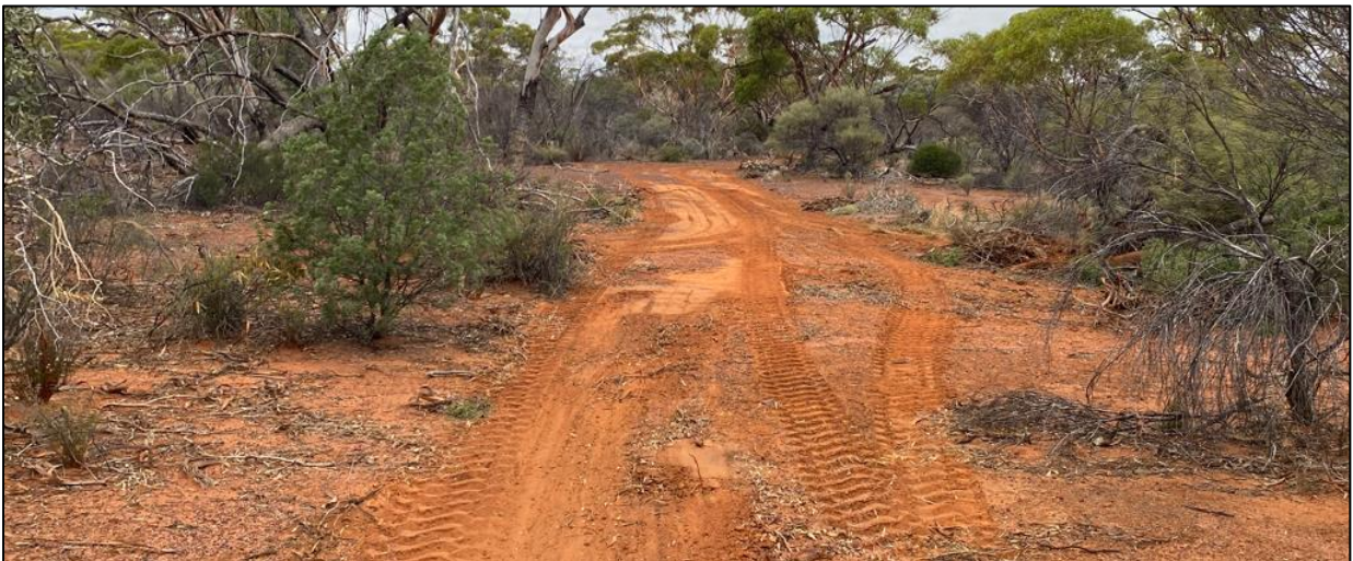
Figure 2: Barlee Project Track Clearing completed