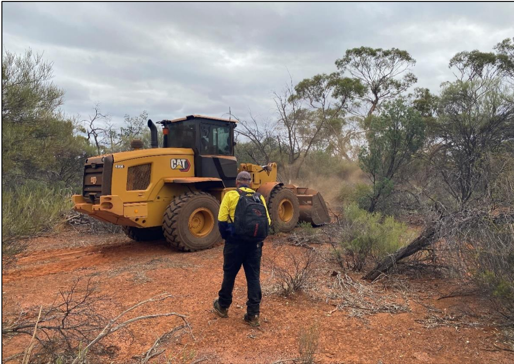
Figure 1: Barlee Project Track and Drill Pad Clearing underway