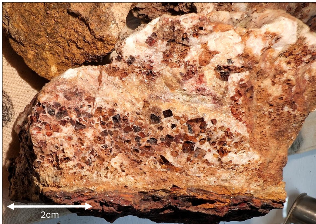
Figure 1. Sample 8931-019: Quartz vein displaying banded boxwork textures after sulphides, which returned 12.6 g/t Au

Importantly, rock chip assays exceeding 5 g/t Au have been returned from multiple locations distributed along the 360m mapped extent of the vein system (Fig. 2), supporting the interpretation that the vein is mineralised along strike, although the selective nature and spacing of rock chip samples mean grade continuity has not yet been established. This represents a material increase in confidence in the scale and continuity of the gold-bearing system at Undoo Creek and further supports the prospect as a priority target for ongoing exploration. These results support previously reported initial rock chip results from Undoo Creek of 5.42 g/t Au and 2.61 g/t Au 1,2 .