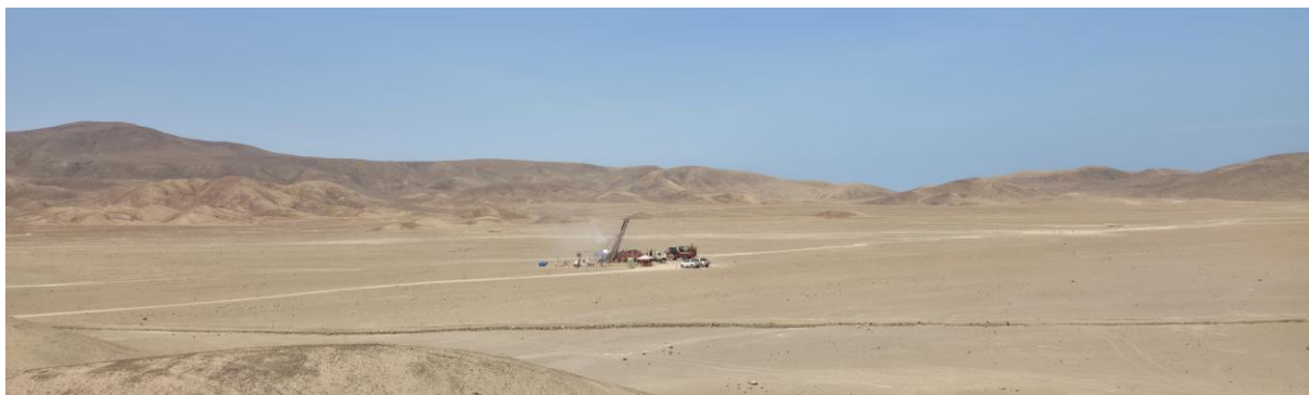
RC Drilling re-commences at Cangallo to expand the copper found beneath the extensive but thin cover sediments.