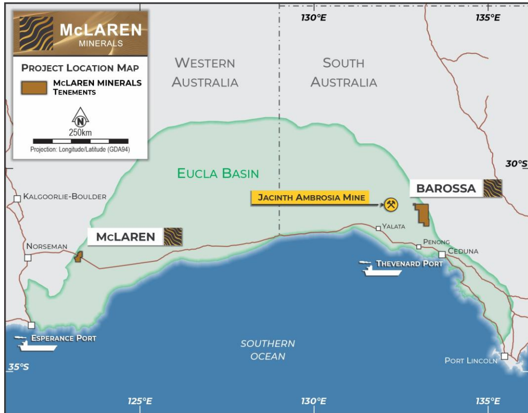
Figure 1 – McLaren Minerals Limited Eucla Basin Projects Location Map

McLaren Minerals Limited (ASX: MML) ("McLaren" or "Company"), is pleased to provide an additional update on its recently acquired Barossa Project, located approximately 90 km southeast of Iluka's tier one Jacinth-Ambrosia mine, north and slightly west of Thevenard Port, in South Australia.