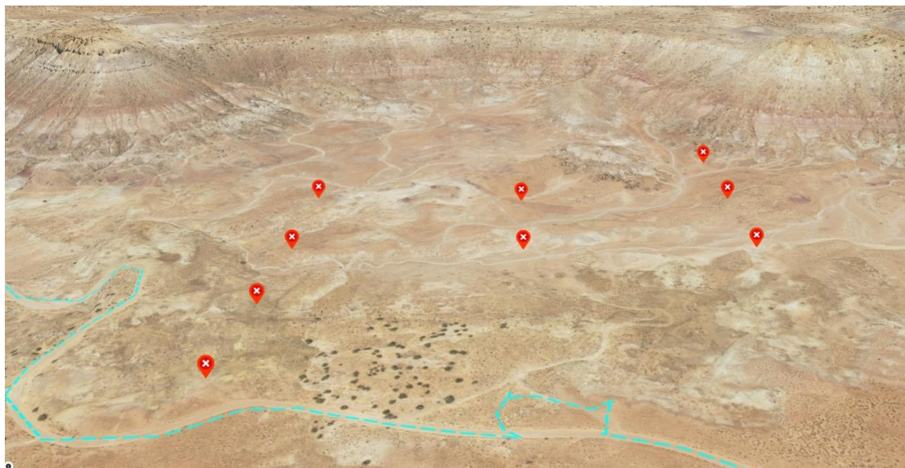
Figure 2: Plan showing the proposed drillhole locations to be carried out east of the “Cactus Rat” mines

Anson’s exploration sampling programs confirm the high grade mineralisation of uranium and vanadium on the eastern and western areas of the project within the sandstone units of the Morrison Formation, see ASX Announcements 15 October 2020 and 21 September 2021.