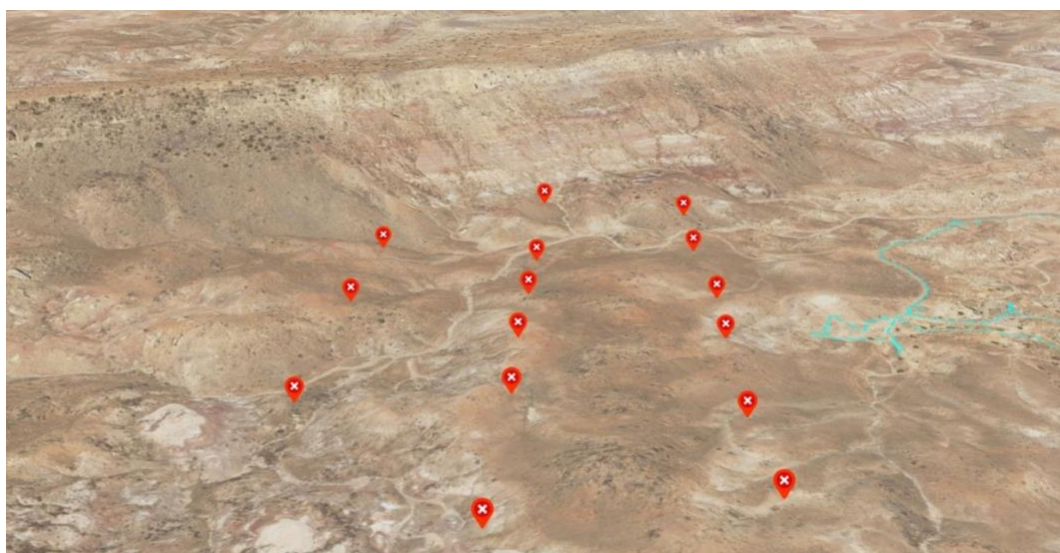
Figure 1: Plan showing the proposed drillhole locations to be carried out west of the “Windy Point” mines.

The “aircore” drilling program of 1,000 meters is expected to be completed in two weeks with 0.3 m (1 ft) samples to be collected through the mineralized zones and 0.9 m (3 ft) composite samples over the remaining intervals and sent to a certified laboratory for assay. It should be noted the previous exploration program conducted by the Company yield values up to 10,3% U 3 O 8 and 25.6% V 2 O 5 , see ASX Announcements 15 October 2020 and 21 September 2021 .