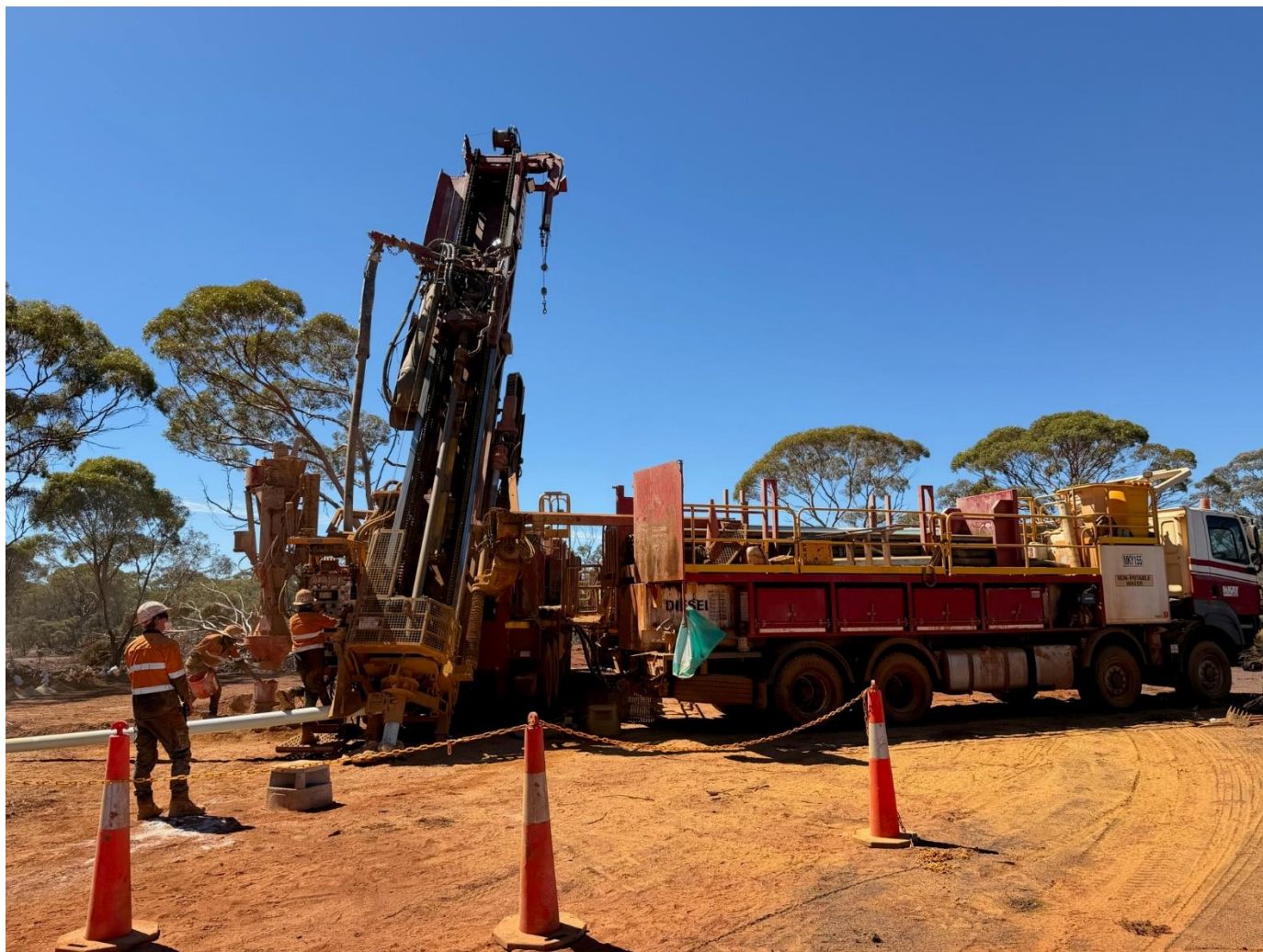
Figure 1: RC Drilling commences at the Rockland gold project, near Kalgoorlie

The programme follows highly encouraging results from the Company’s initial discovery drilling at Rockland, announced in early 2025, which confirmed an approximately 1km trend of significant gold mineralisation across the Mining Lease. The new programme is designed to systematically follow up those results, testing both the strike and depth extensions of the known mineralised zones with a view to defining a maiden Mineral Resource.