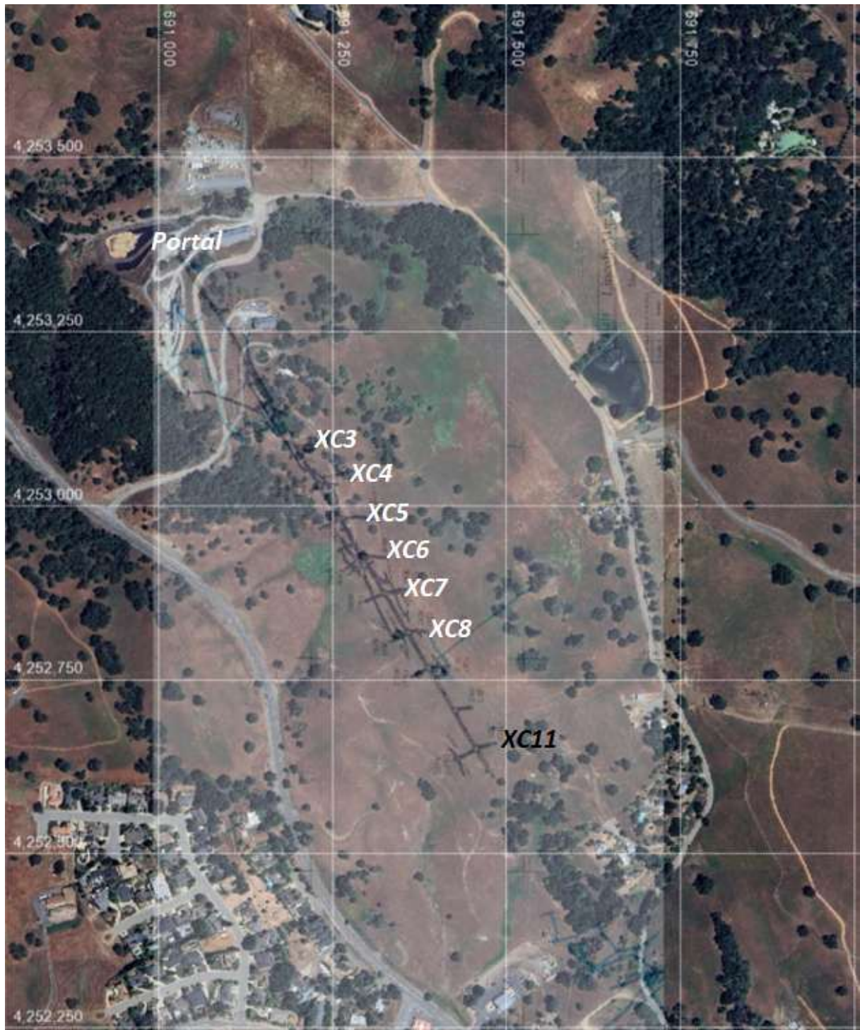
Figure 4: Aerial View on southern portion of Lincoln gold project showing location of Stringbean Decline, and location of drill sections from respective crosscuts XC3-XC8.