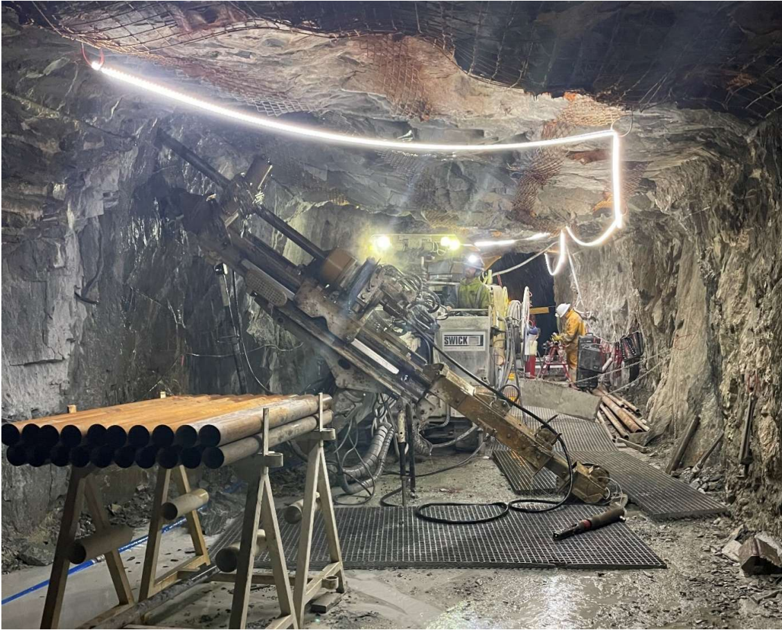
Figure 1: Diamond Drilling at XC5E- drill hole DDH276, drilling oblique to section, looking west towards decline.