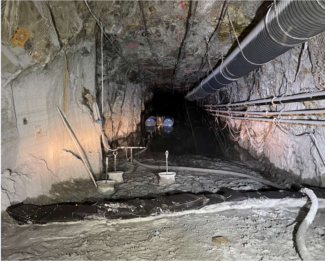
Figure 2: Dewatering progress at Stringbean Alley Decline- view from XC7 towards XC8 (15/3/2026 PST).