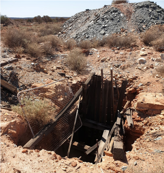
M31/481 Senate Mineshaft circa 1930's