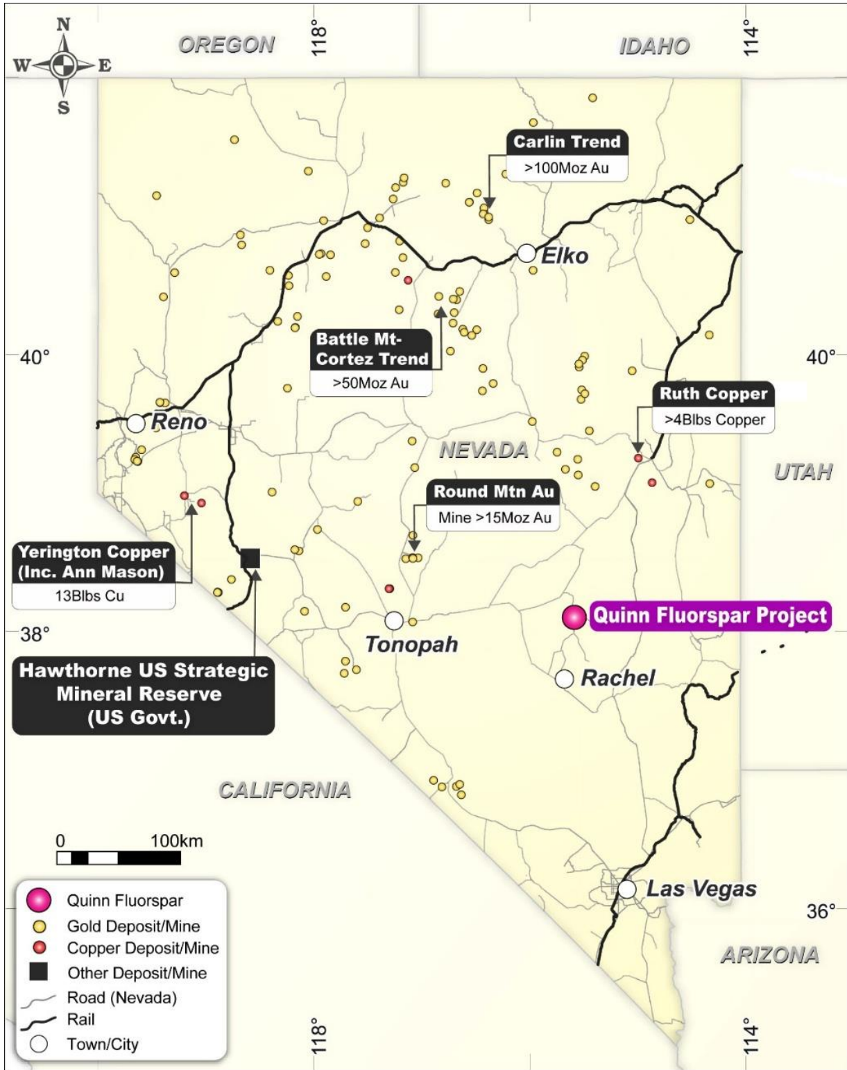
Figure 2 Quinn Fluorspar Location in Nevada.