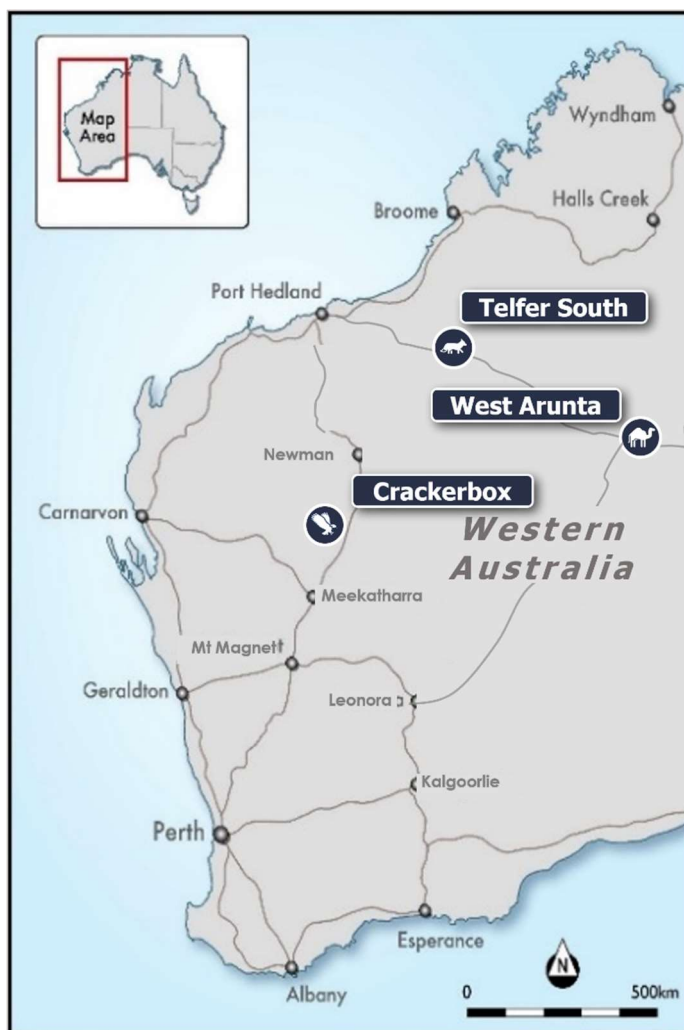
Figure 1 – Telfer South Project Location