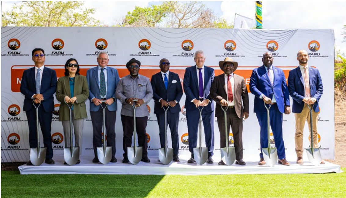
Image 11: The Hon. Anthony Mavunde, Minister of Minerals, officiated the Mahenge groundbreaking event and broke ground accompanied by senior government officials, representatives of POSCO and the Company's Board and executives

This Project represents one of the key efforts under the MSP, reflecting MSP's shared commitment to building more secure, diversified, and sustainable critical mineral supply chains. POSCO is contracted to take all fines from the Project. An associated company, POSCO Future M, has commenced building a new Spherical Purified Graphite plant to support its existing 70ktpa Sejong anode plant in Korea.