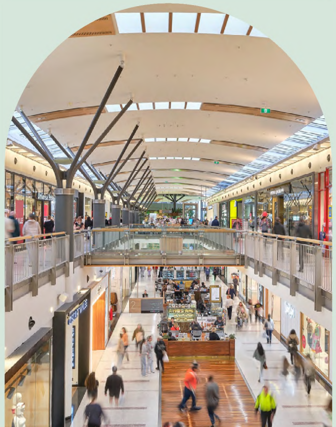
Macarthur Square, NSW

Securityholders may appoint proxies (including the Chairman of the Meeting) to cast their votes on their behalf at the AGM. More information on appointing proxies is available on page 7.