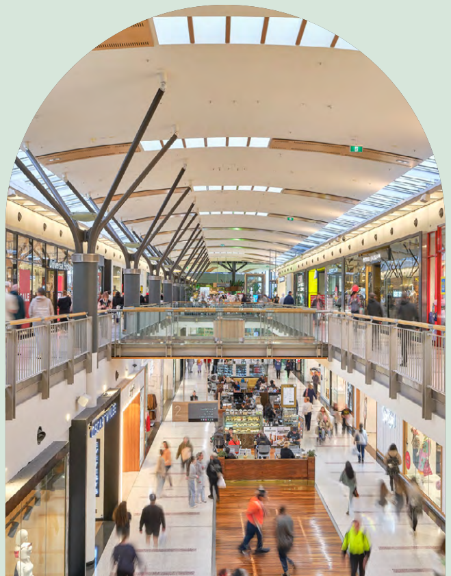
Macarthur Square, NSW

Securityholders may appoint proxies (including the Chairman of the Meeting) to cast their votes on their behalf at the AGM. More information on appointing proxies is available on page 7.