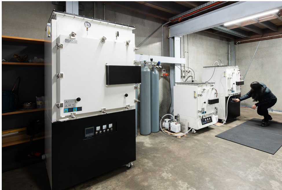
Figure 3: Furnace Room