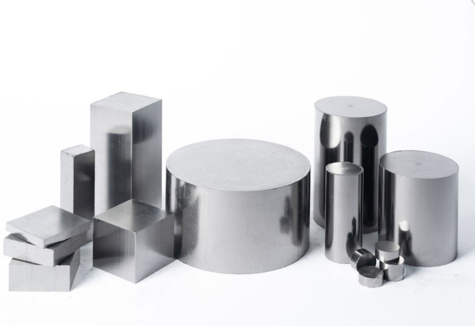
Figure 1: Selection of VHD Blocks at Various Production Stages