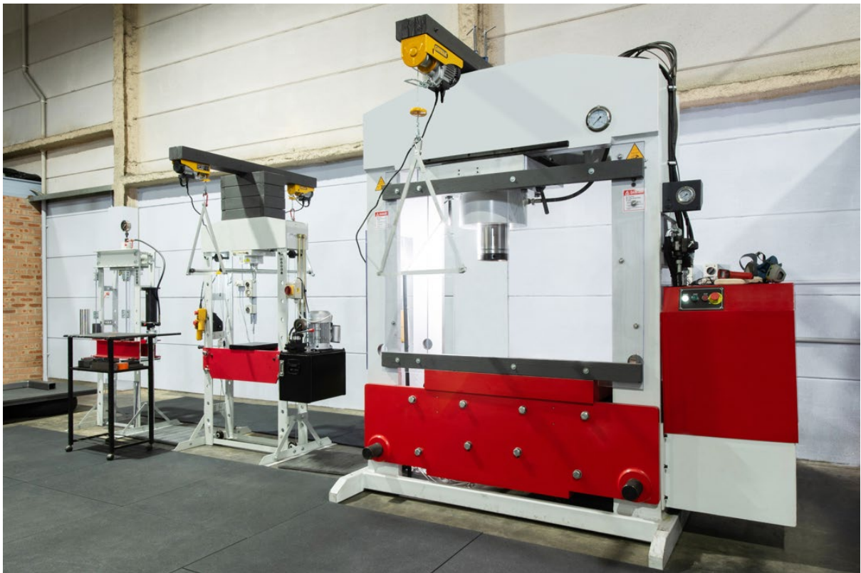
Figure 2: Pressing Station