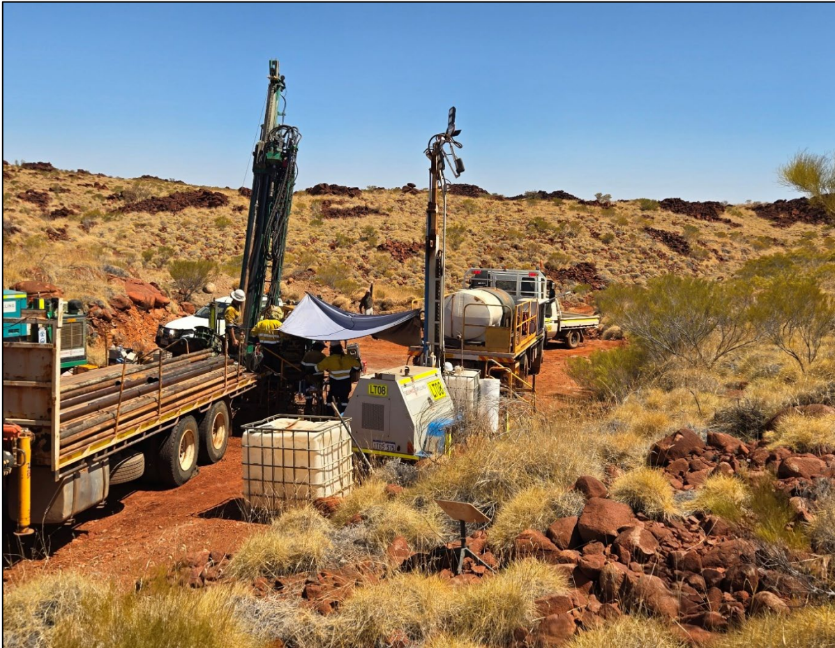
Photo 1: Diamond Rig on Hole 26GTDD004 at Munni Munni PGE-Cu-Ni Project

“With strong global demand for PGEs, improving metal prices and district-scale consolidation achieved, this Phase 1 drill program is designed to transition Munni Munni into a modern, JORC (2012) Resource and position the Company for the next phase of technical and commercial evaluation to create value for our shareholders.”