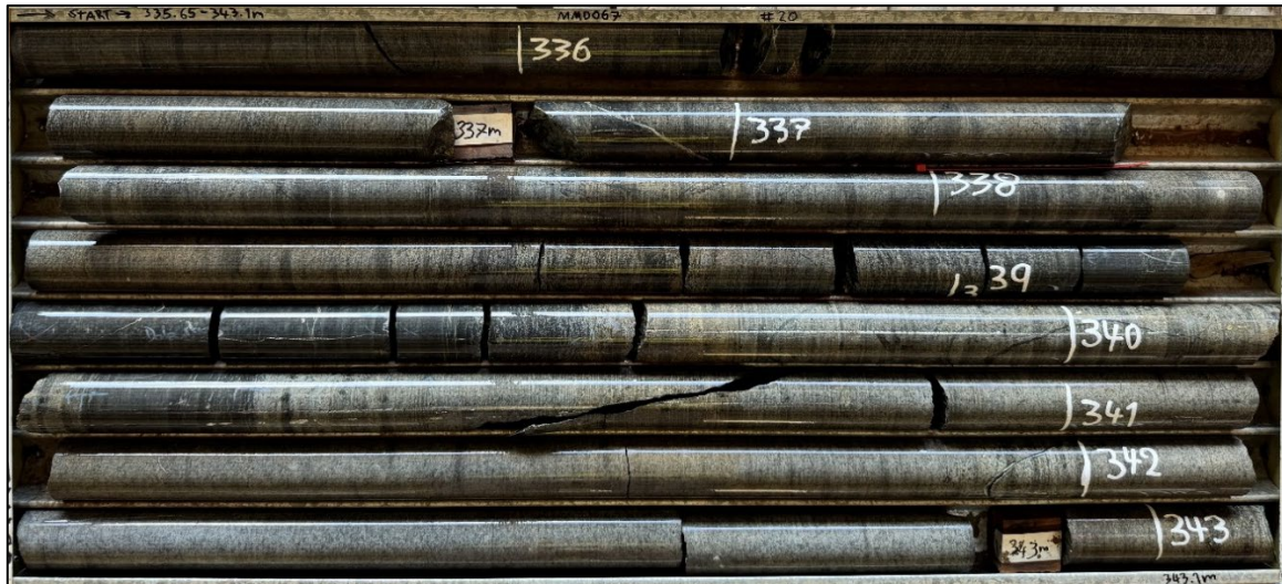
Photo 2: Example of core from Munni Munni historic drilling demonstrating excellent preservation