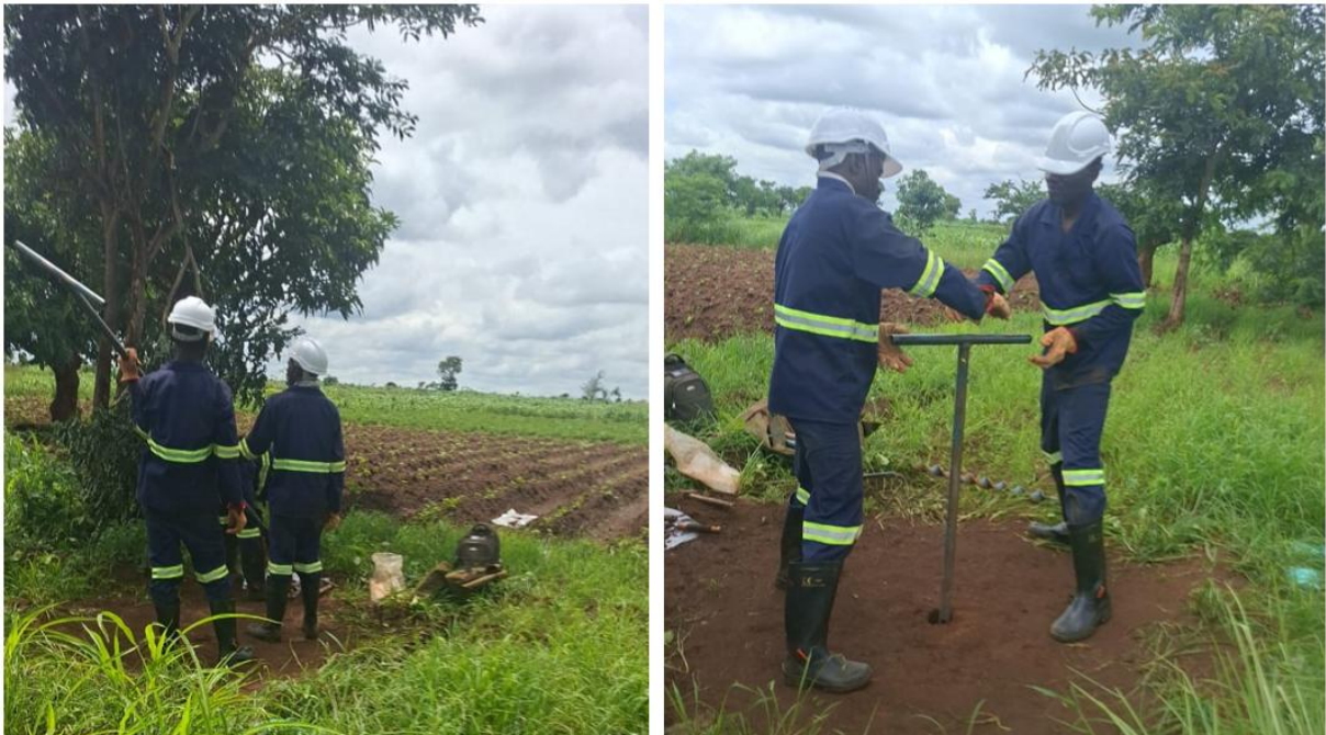
Figure 5 & 6: Further images of NGX's Malawi team hand augering and logging at its Msinja Licence.

The Company is actively assessing further opportunities in the clean energy space, other critical minerals sectors as well as other high-growth opportunities to expand and complement its current portfolio. During the period, NGX evaluated multiple prospective transactions, with several discussions remaining ongoing.