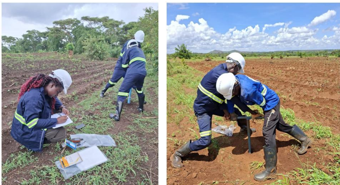
Figure 2 & 3: NGX's Malawi team hand augering and logging at its Msinja Licence.

During the period, NGX commenced an auger drilling exploration program across all three licences in Malawi. The Company is investigating the known high-grade titanium mineralisation across Malingunde and its other regional projects, Msinja and Lifidzi. Initial work was completed by the previous owners, Sovereign Metals Limited, who confirmed the presence of high-grade titanium and its potential to be a by-product in the operation. The initial focus was at Msinja with the completion of the first phase. The raw samples have been split and despatched to South Africa for processing and analysis.