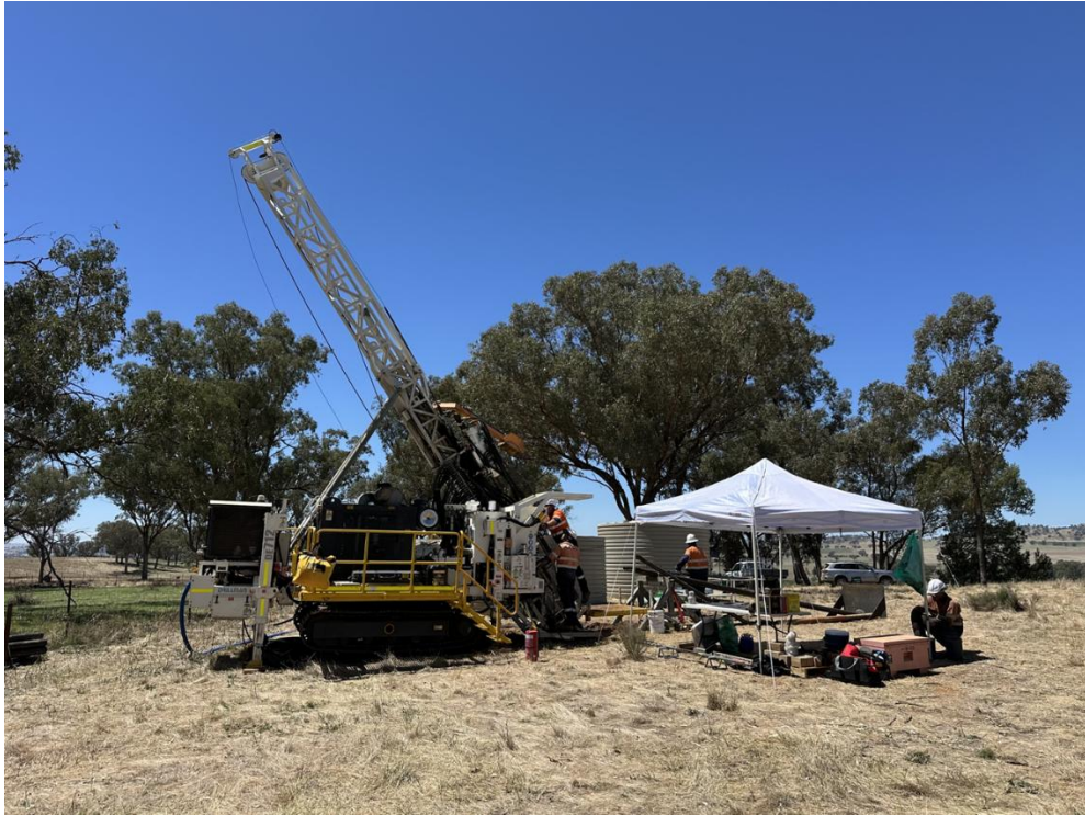
Figure 1. Drilling commenced at the Neila Creek project on drill hole PORD001.

The Neila Creek tenement (EL8864) is an early-stage exploration prospect covering approximately 43 square km. It is located in a recognised volcanic belt hosting large scale, world class mineralised systems and therefore offers a unique opportunity for GGR shareholders (see project location map below).