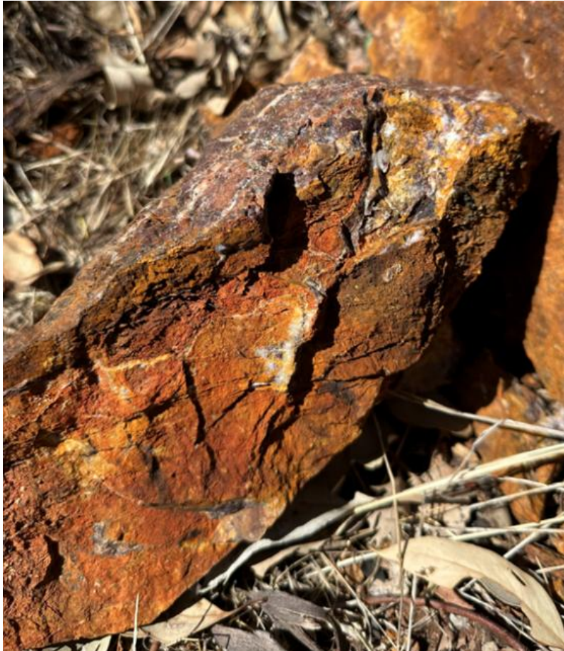
Figure 3. Sample 8864-001 (0.418ppm Au)