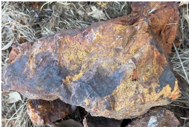
Figure 4. Sample 8864-002 (2.160ppm Au)

It is considered that the current Phase 1 exploration program will demonstrate the potential of the area leading to a second phase of drilling.