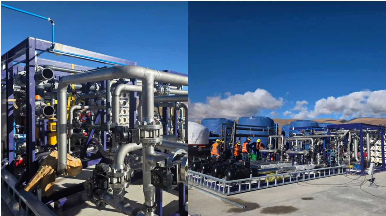
Figure 2. Nanofiltration Plant Assembly

Galan has accumulated a substantial brine inventory in its evaporation ponds, positioning the Company to transition efficiently into processing once commissioning is complete. The nanofiltration plant has been designed with flexibility to support production beyond the 5,200 tpa LCE Phase 1 rate.