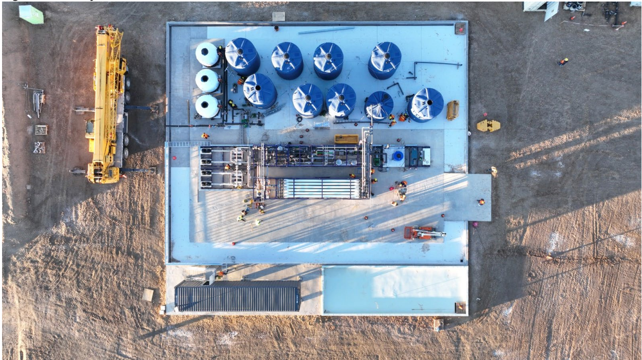
Figure 3. Nanofiltration Plant

The Galan Board has authorised this release.