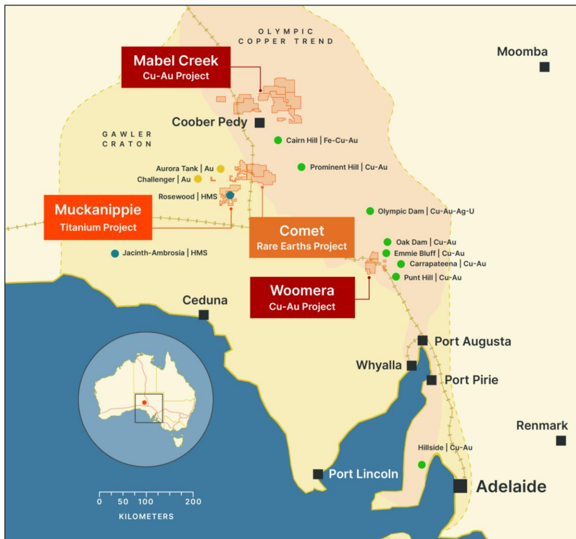
PTR Minerals' Project Locations in South Australia

The Company also has highly prospective copper, gold and rare earth projects. Its Woomera and Mabel Creek copper-gold projects are located in the world-class Olympic Copper-Gold Province of South Australia. Work has uncovered Iron-Oxide Copper-Gold style alteration/mineralisation and geophysical targeting work has identified several compelling Tier-1 Copper-Gold targets which are drill ready. The Company's Comet Project is historically noted for its numerous gold occurrences however early stage greenfields drilling has identified significant Rare Earths hosted in shallow clays over large areas, at 3 Prospect sites.