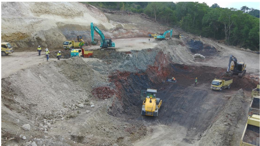
Figure 1: Open Pit - Ira Miri manganese project 1,2