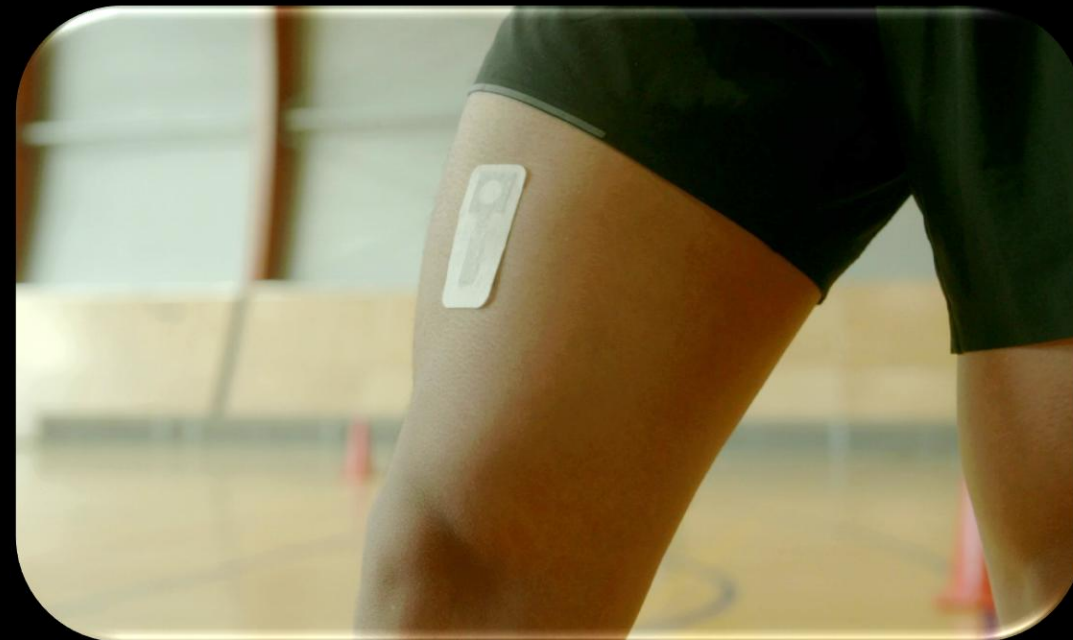
Applications span healthcare, performance, and institutional environments