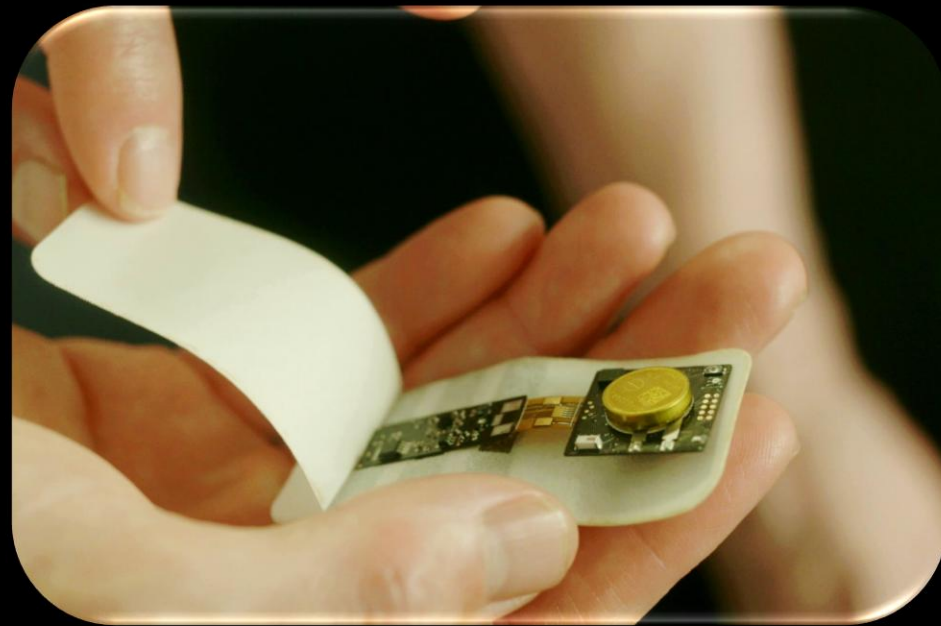
NeuroStrip is in-market and being used across multiple settings