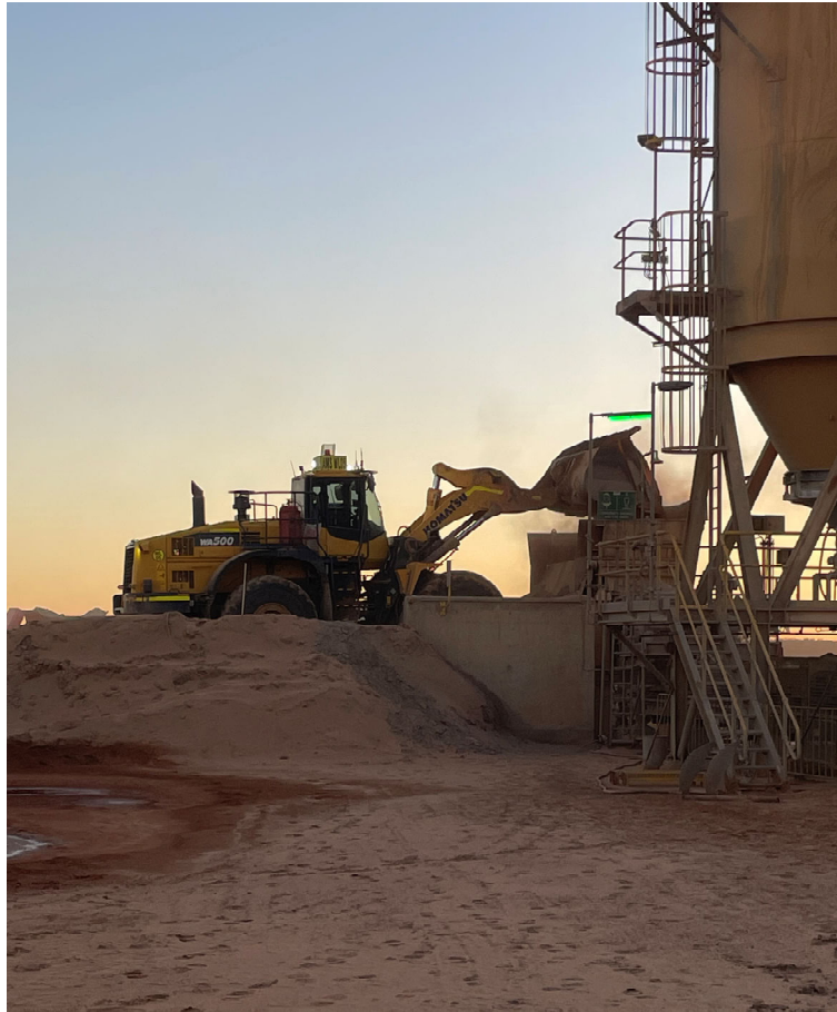
Figure 3: First Ore being loaded into the mill feed hopper.