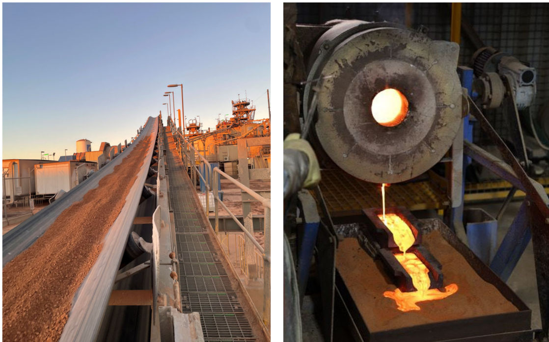
Figure 1: First Fingals Ore on the main conveyor at Lakewood and first gold pour from the Fingals and Majestic mines.