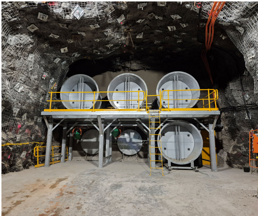
Figure 4: Majestic's primary ventilation fans installed in January 2026.

For further information, please contact: