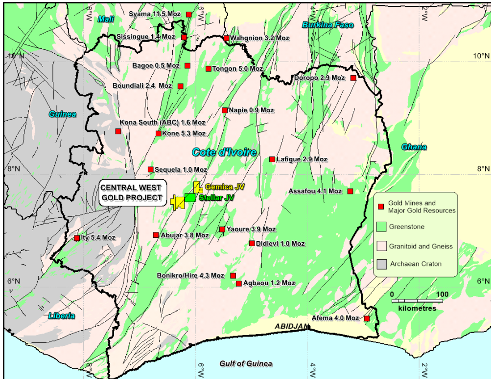
Figure 2. Map illustrating the location of Central West Gold Project permits in Côte d'Ivoire

The Company's Central West Gold Project, comprising the Gemica JV and Stellar JV permits cover a combined area of 1,315 km 2 , strategically situated along the Abujar–Napié gold trend within the Oumé–Fetekro Birimian greenstone belt in central Côte d'Ivoire, 65km to 135km northeast of the Abujar Gold Mine and 160 km southwest of the Napié Gold Deposit (Figure 3). Further details of the permits are provided in Table 1.