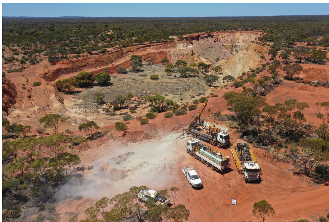
Figure 1: JBell RC Rig drilling with the Lizard historic Pit in the background