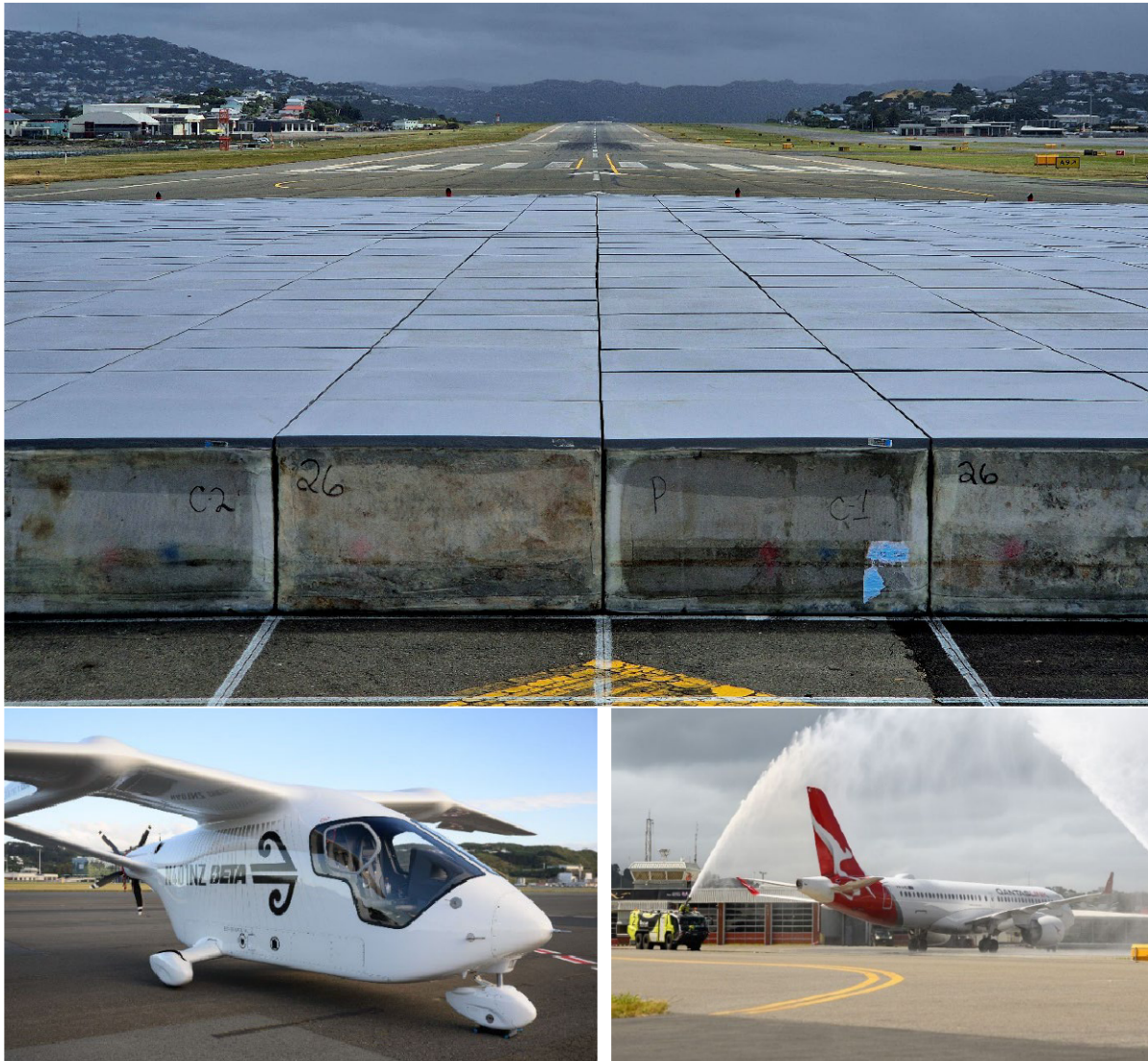
Top image: the new EMAS runway extension at the southern end of the runway. Bottom left: the Air New Zealand BETA electric aircraft. Bottom right: Qantas' Airbus A220 arrives in Wellington.