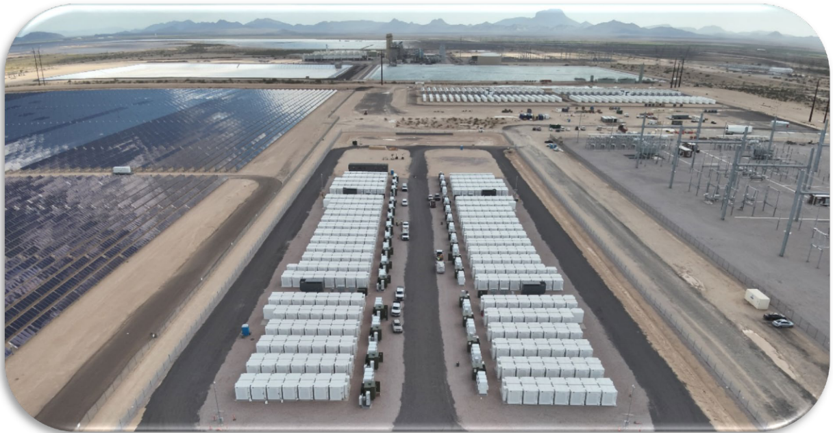
The Sun Pond solar and battery storage project in Arizona.

Demand for energy remains elevated in the United States and one of the key drivers is the rapid growth in data centre construction. Solar energy is a fast and effective solution for data centre supply, as evidenced by Longroad's 400MW 1,000 Mile project being built to supply a Meta data centre. Longroad is putting more focus on this opportunity with recruitment underway for new roles dedicated to data centre development.