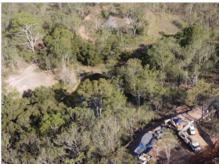
Figure 1: Hole SBD001 at bottom of image, with the pad for hole 26P02 visible on left of image and an old mullock heap from the South Burnett Mine visible at top of image

Drilling consisted of 1,179 metres across four diamond drill holes, with samples currently being delivered to the ALS laboratory in Brisbane. Final hole locations, depths and orientations, which were adjusted to suit geological observations, will be released alongside assay results which are expected to be received in approximately 6-8 weeks.