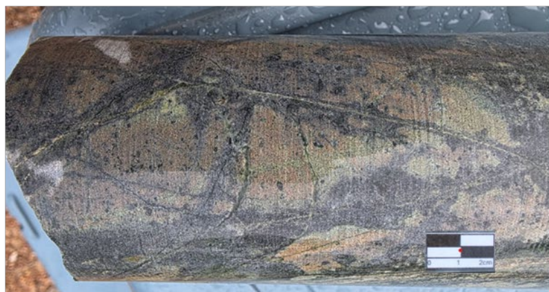
Figure 2: Top: photo of a core tray showing drilled interval 317.79 to 321.13m from hole MCDD07. The core shows phyllic altered volcanic rock with intense quartz-carbonate veining with pyrite suggesting proximity to a porphyry-related mineral system. Middle: Photo of drill core from MCDD06 at approx. 396m depth showing stringers of pyrite and magnetite in propylitic altered (chlorite + epidote + magnetite) volcanic. Bottom: photo of drill core from hole MCDD06 at 419m depth showing patchy zones of potassic altered (potassic-feldspar + magnetite) volcanic rock. Selected intervals will be sampled for assay.

* Cautionary Statement: Visual estimates of mineral abundance should never be considered a proxy or substitute for laboratory analyses where mineral concentrations or grades are the factor of principal economic interest. Visual estimates also provide no information of deleterious physical or chemical properties that may negatively affect the project's economic viability and valuation.