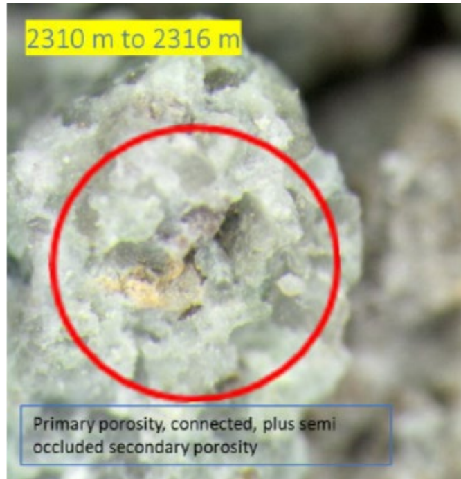
Cuttings showing porosity from the Bandanna Formation

Specialized rock typing has been undertaken over drill cuttings at the key reservoir levels. The analysis identified good visual porosity and indications of permeability in a number of the zones proposed for testing.