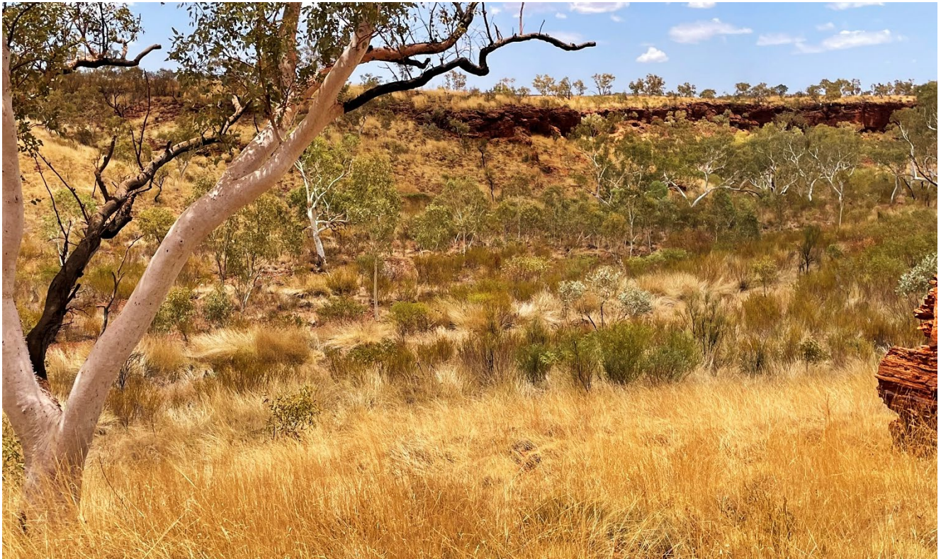
Figure 2 - Looking towards upside exploration areas that require mapping and drilling