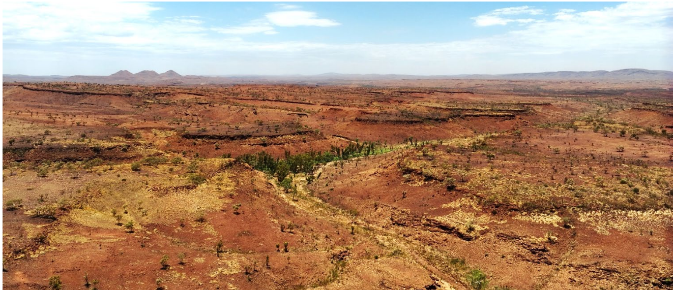
Figure 1 - Aerial image of Extension Iron Ore taken during the recent aerial survey and site visit.