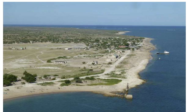
Fig 6 – township from Escarpment (looking S)