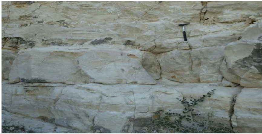
Fig 2 – High Purity Limestone Exposure in the Soalara Escarpment Face

The Project's resource is a near horizontal elevated sequence of Limestones forming a coastal escarpment directly adjacent to Soalara township ( Figs 2-4 ). Close proximity to Toliara port (~28 kms) and the national road network from the top of the escarpment plateau further supports cost effective logistics options for a future mining operation to transport high purity Limestone to domestic or international markets, including to existing cement production facilities in the Soalara region.