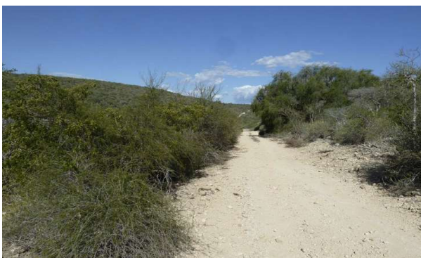
Fig 5 – Limestone at surface on top of the Escarpment

The very shallow nature of the Limestone at and near surface up to only ~1.5m of overburden ( Fig 5 ), allows a very low stripping ratio for highly cost-effective open pit mining.