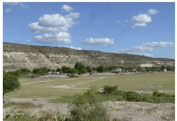
Figs 3/4 – Limestone Escarpment (LHS - looking NW from adjacent coastal township, RHS – Looking NE)

The very shallow nature of the Limestone at and near surface up to only ~1.5m of overburden ( Fig 5 ), allows a very low stripping ratio for highly cost-effective open pit mining.