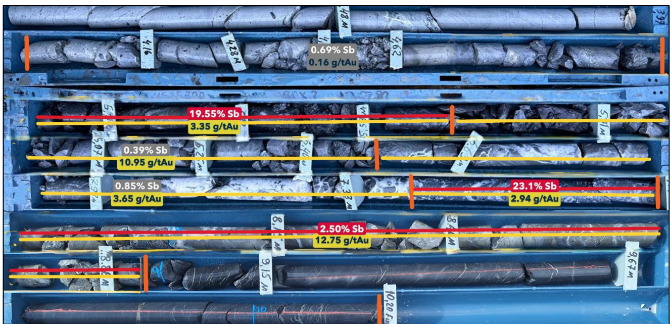
Figure 4 - Photo of core from drillhole UG25ZOP003 showing distribution of sample intervals and high-grade assay results.