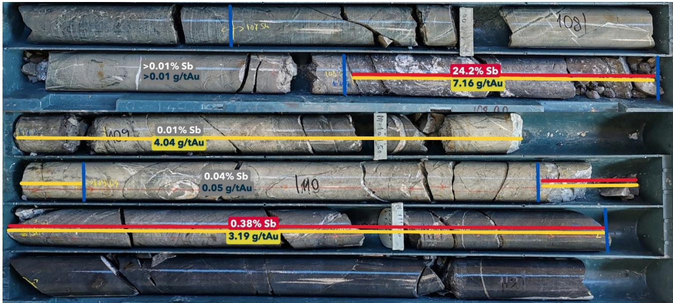
Figure 2 Photo of the core from drillhole DD25ZOP014 showing distribution of the mineralised zone with high-grade antimony and gold grades.