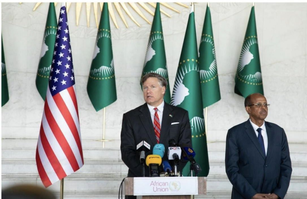
Unites States Deputy Secretary of State Christopher Landau and AUC Chairperson Mahmoud Ali Youssouf at Wednesday’s announcement (1)

These investments will leverage AU expertise alongside US capital and innovative financing tools to develop critical minerals and commodities supply chains , transportation corridors, energy networks and regulatory harmonisation as well as to increase two-way trade”