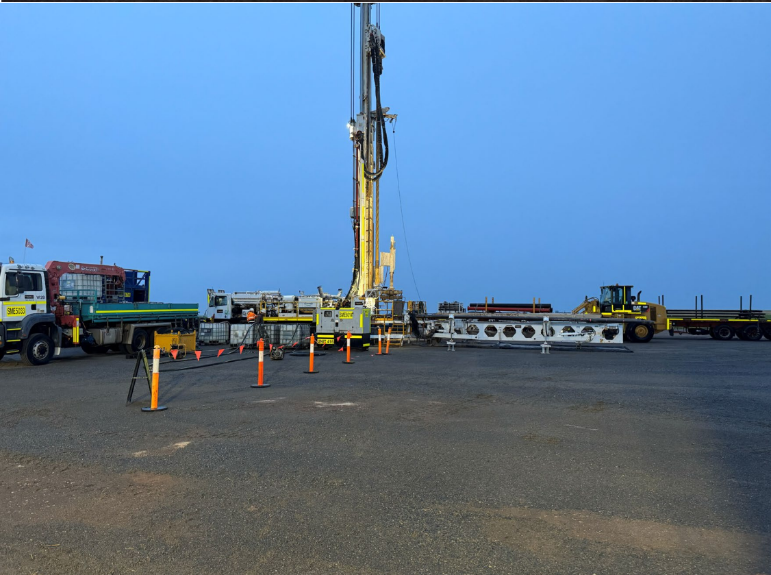
Images: Ramsay 4 wellsite during drilling