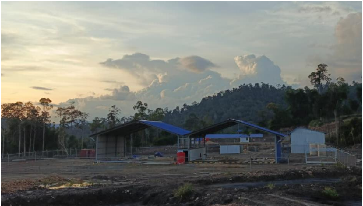
BBM Mixing Plant