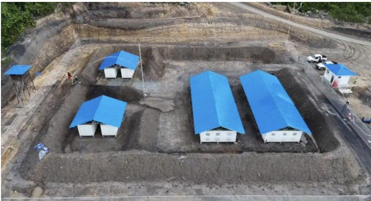
BBM Mine Magazine

The Company will continue to keep the market informed as further operational milestones are achieved.