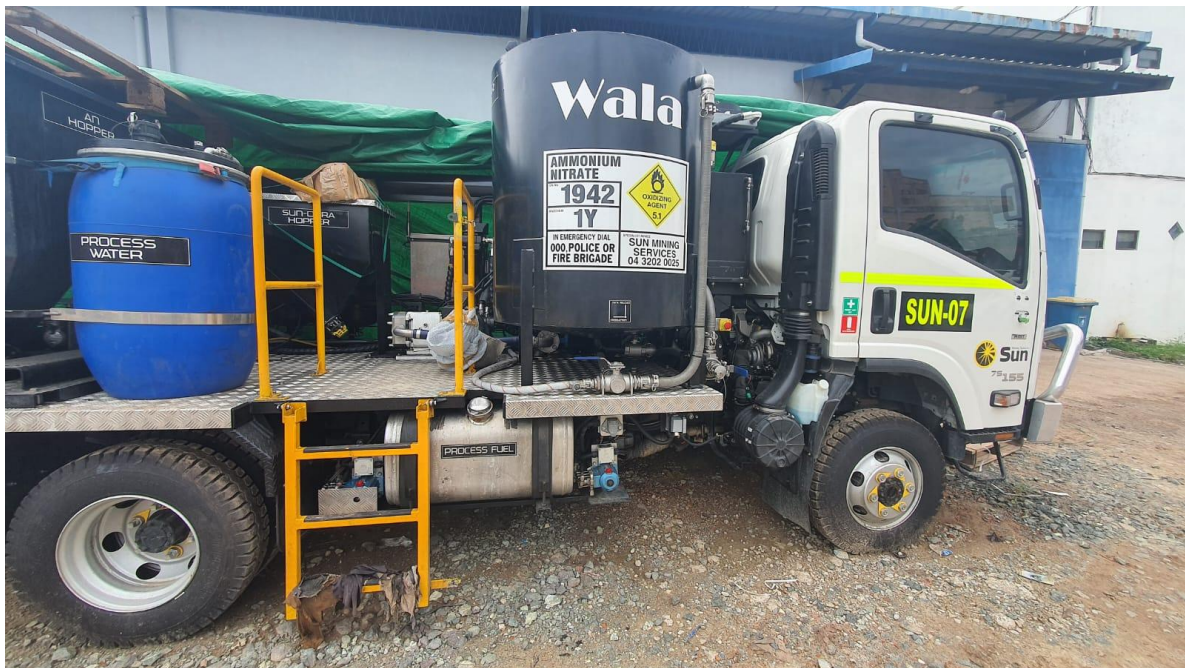
SMS Wala Gel Mixing Trucks (Imported from Australia)