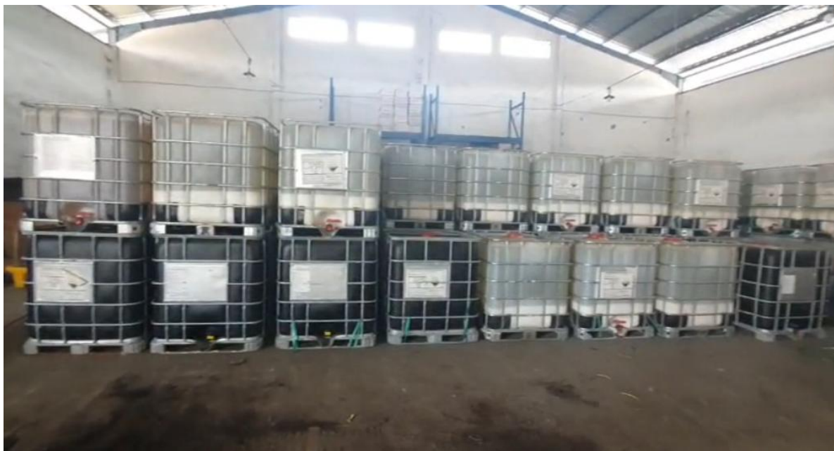
SMS Wala Gel Stock (Imported from Australia)