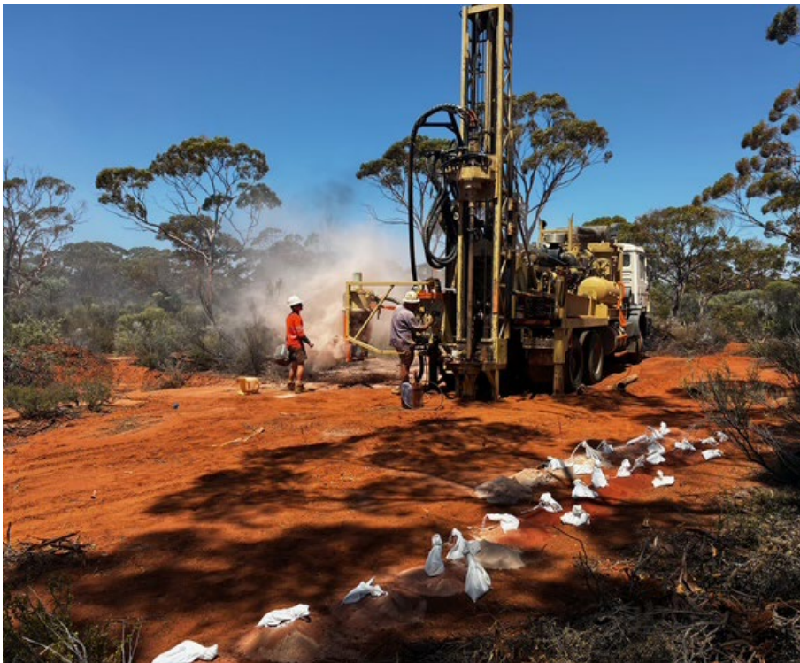
Figure 1: Drilling at the Chifley Project

Up to 30 sites have been prepared for a total of approximately 1,500m drilling planned based on an average hole depth of 50m.