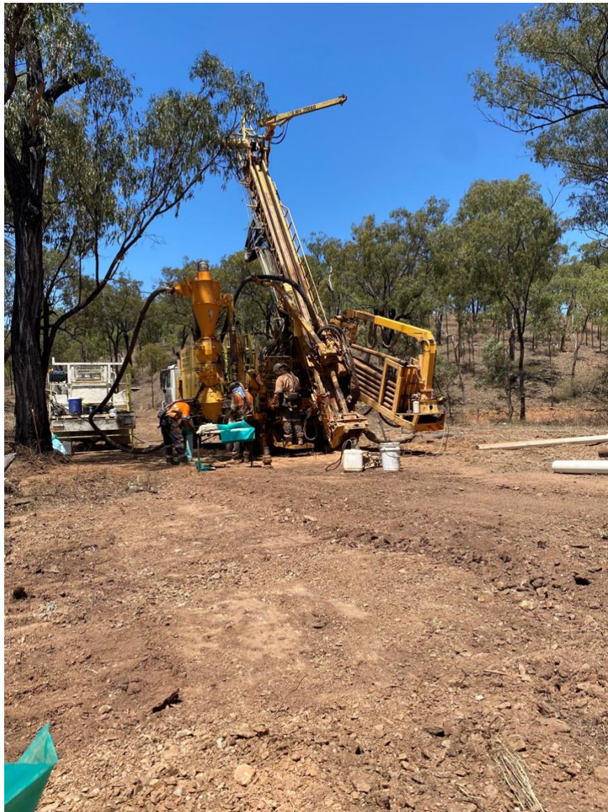
Figure 1 – RC Rig at the Clermont Gold Project in the initial drilling campaign.

Results from this first pass of drilling provide us with a clear and compelling pathway for follow-up drilling across Leo Grande, before we turn our attention to the broader opportunity within the Clermont Gold Project.”