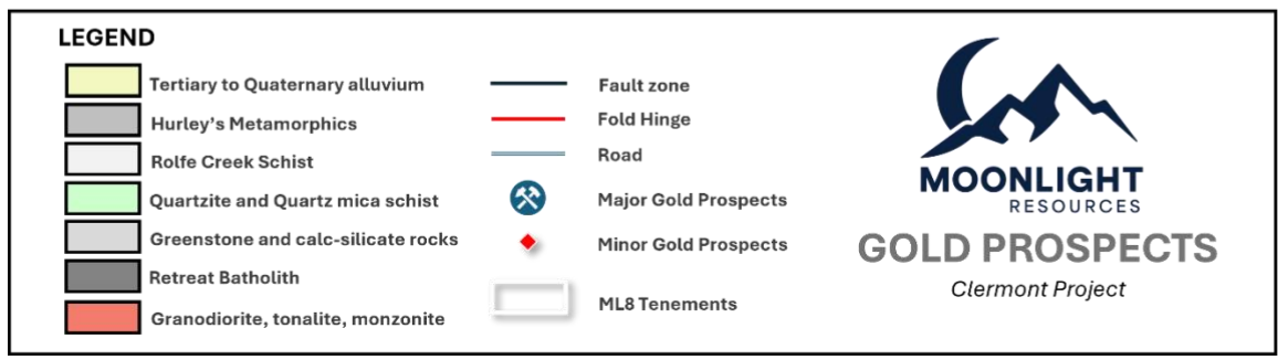
Figure 3 – Four compelling Prospect Areas at the Clermont Gold Project