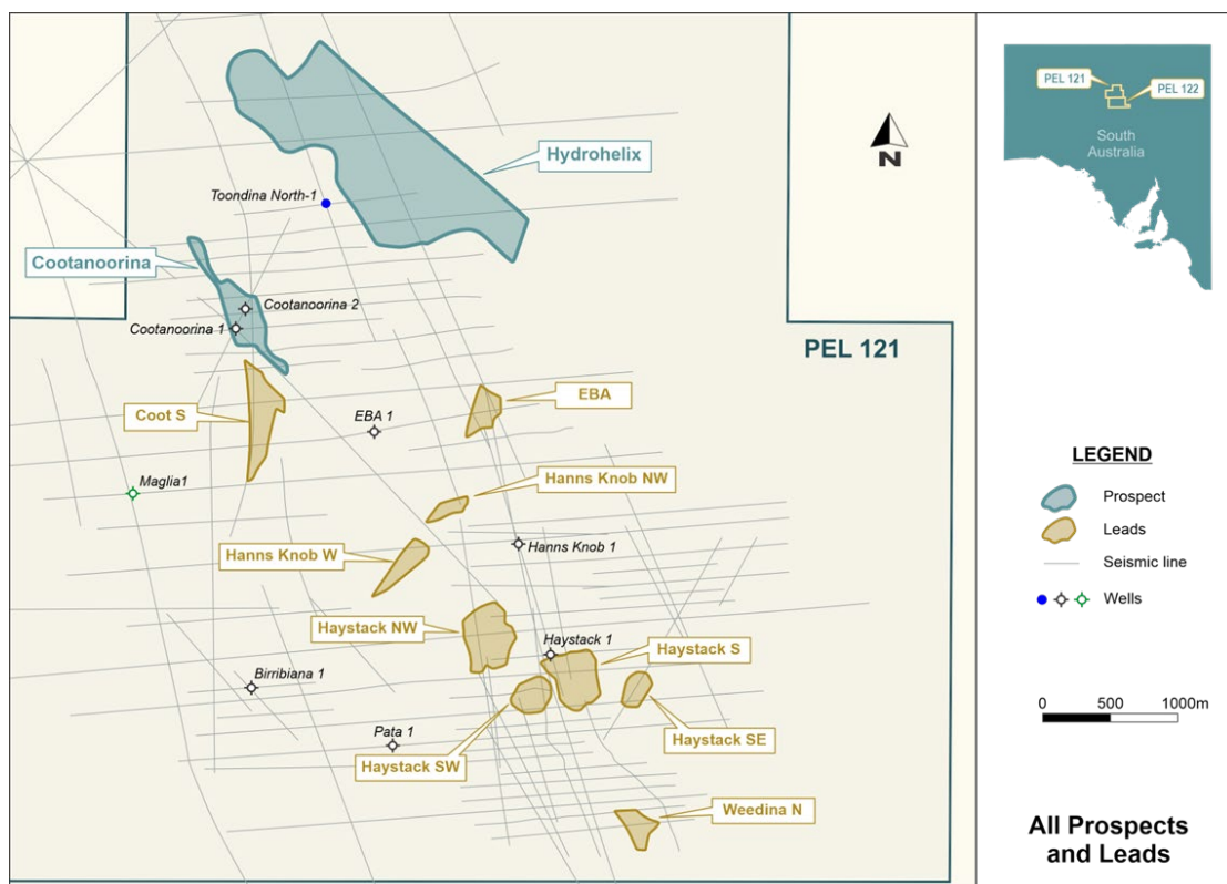
Figure 2 Ackaringa Project Prospects and Leads

Nine other early-stage leads have been identified on PEL 121 (see Figure 2 below), with work to commence to elevate them to Prospect status. Successful drilling at either Hydrohelix or Cootanoorina has the potential to open a new basin for helium and hydrogen exploration and the leads identified would provide meaningful follow-on upside potential.