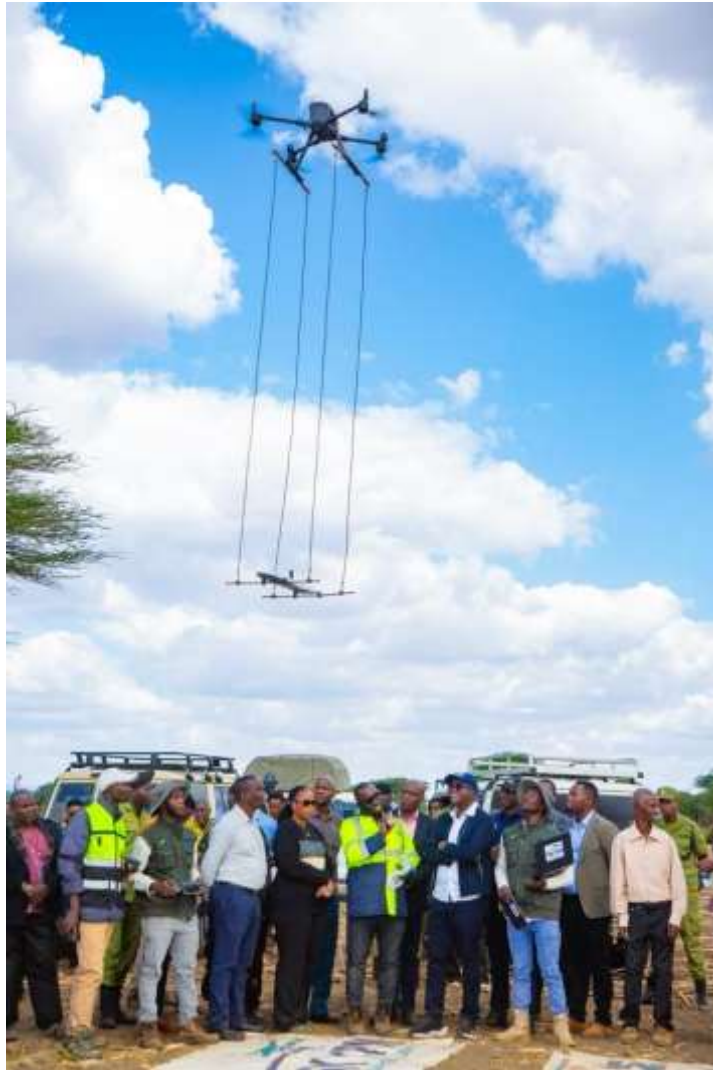
Image 4: Ministerial delegation receives hands on demonstration of drone borne magnetic survey