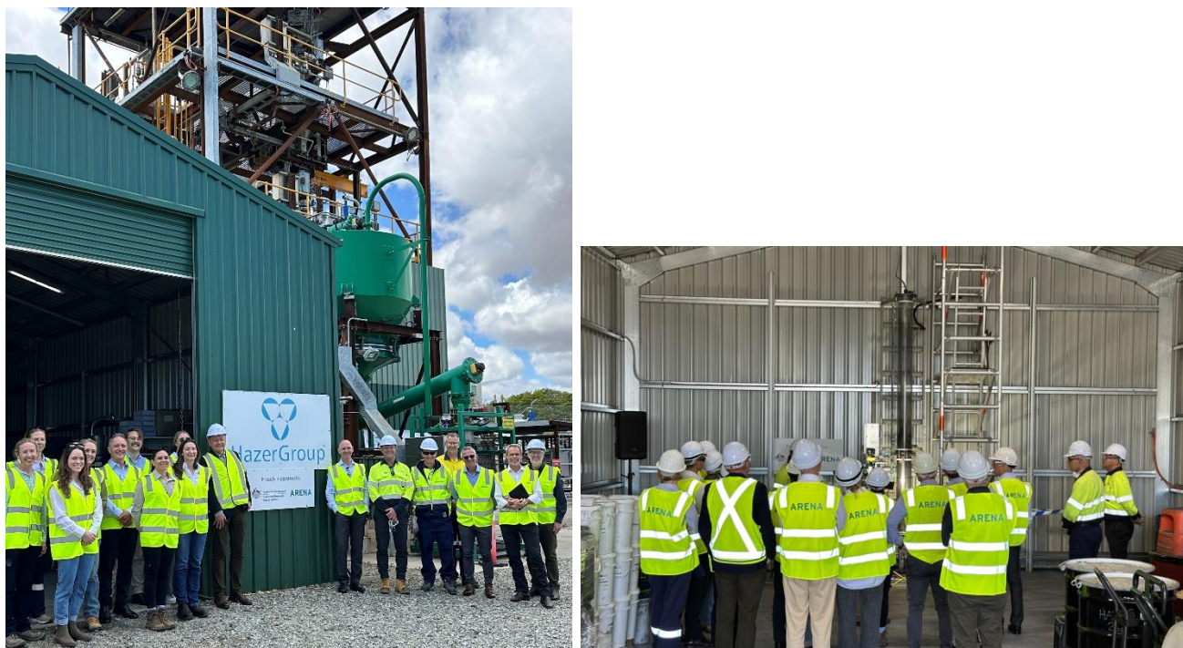
Figure 2: ARENA representatives touring Hazer’s CDP

In October 2025, the Board and Management of the Australian Renewable Energy Agency (“ARENA”) visited the Company’s Commercial Demonstration Plant (“CDP”) in Perth to discuss Hazer’s scalable, low-cost, low-emissions decarbonisation technology, and its applicability to steelmaking, liquid fuels and other hard-to-abate Australian industries.