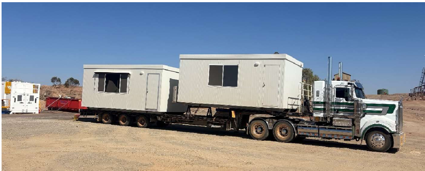
Figure 2 – Delivery of new office buildings to Pinnacles Mine

To support this increased level of activity, the Company has made several targeted operational and technical appointments, strengthening on-site capability across geology, processing and project delivery functions. These hires underpin capacity to execute the expanded drilling program, while enabling parallel progression toward mining operations targeted for the June Quarter 2026.