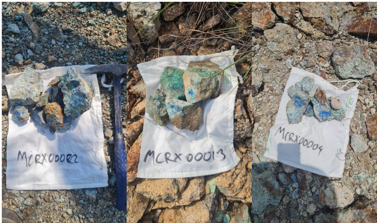
Figure 3: High-grade silver and copper rock samples collected from the Central area

372 g/t Ag, 3.07% Cu , 12.1% Pb and 1.5% Zn (MCRX00004)