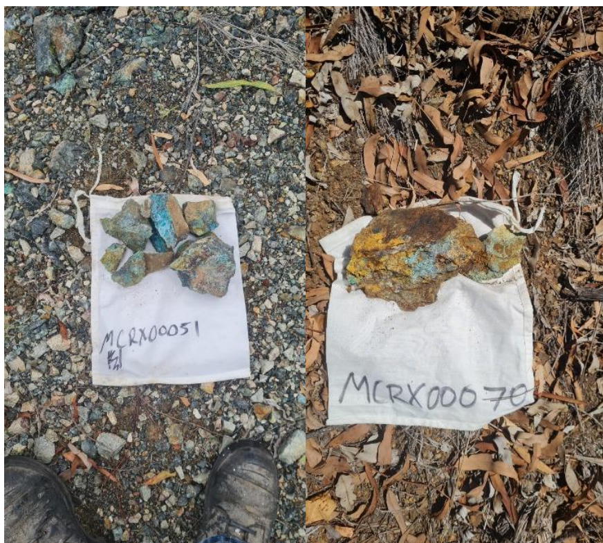
Figure 5: Samples MCRX00051 and MRC00070

The high-grade results from rock chips in this area is very promising and warrents further follow up.