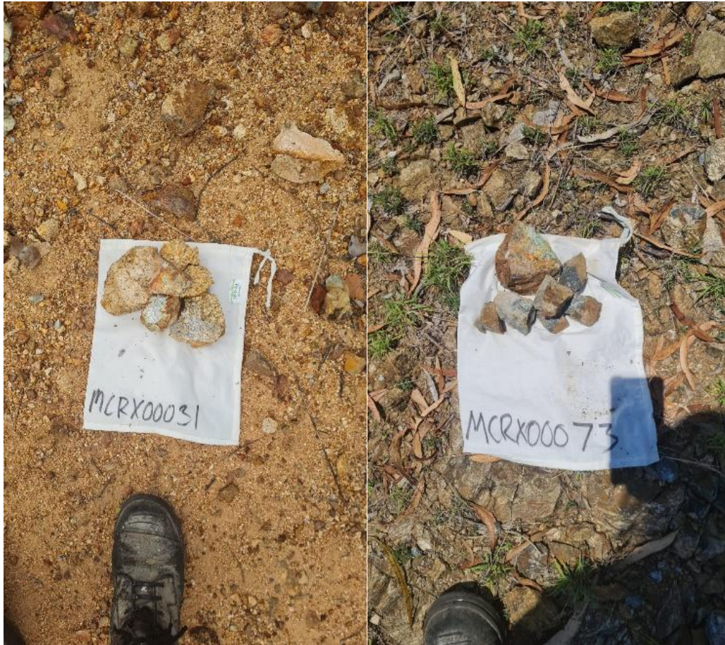
Figure 7: Samples MCRX00031 and MRC00073