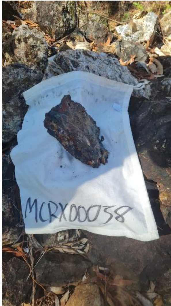
Figure 4: Sample MCRX00058, dark brown rock with elevated copper, though no obvious visual mineralisation