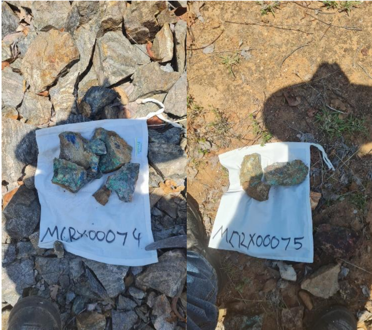
Figure 6: Samples MCRX00074 and MCRX00075

MCRX0031 located 3.2km north of the Central prospect returned 1.58 g/t Ag, 0.17% Cu, 17 ppm Pb and 82 ppm Zn.