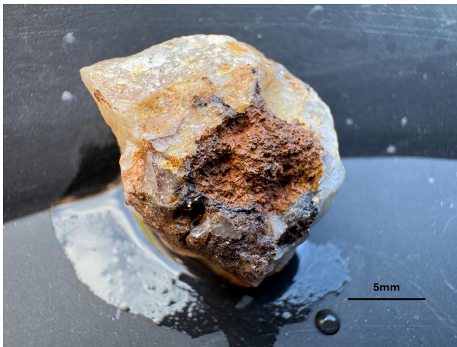
Figure 2: Visible gold in a quartz-sulfide (goethite after pyrite) vein, 25WTRC014 from 33-34m 6 .

In relation to the disclosure of visible mineralisation, the Company cautions that visual estimates of mineral abundance should never be considered a proxy or substitute for laboratory analysis. Laboratory assay results are required to determine the actual grade of the visible mineralisation reported in preliminary geological logging. The Company will update the market when laboratory analytical results become available, expected in January 2026.