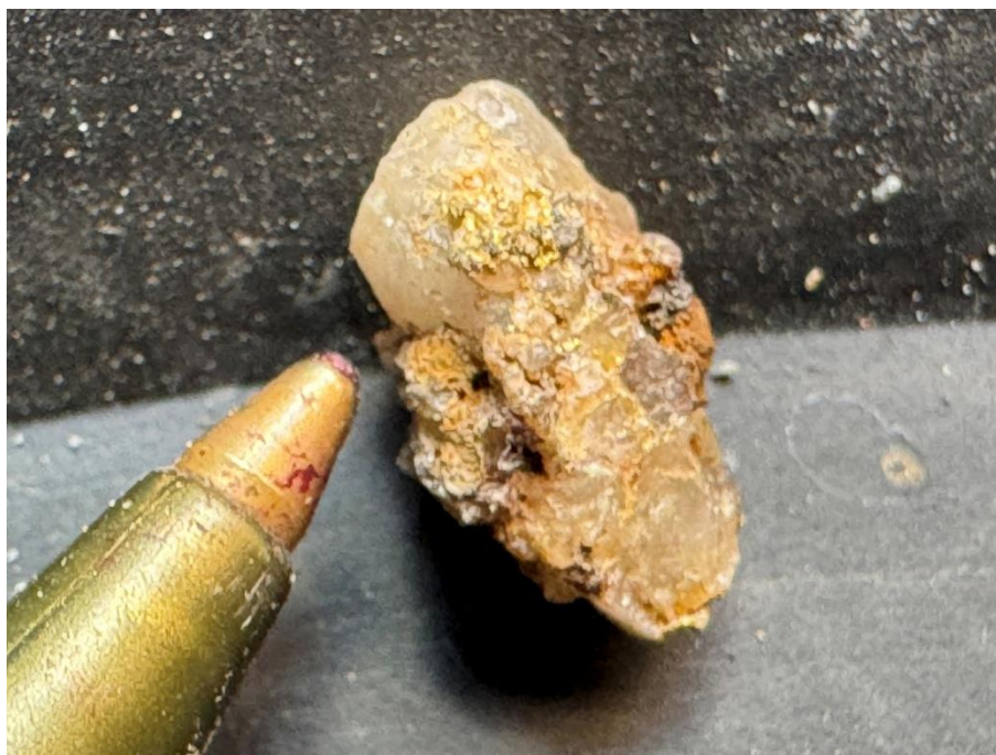
Figure 1: Visible gold intersected in 25WTRC014 from 33-34m (approximate size of fragment is ~10mm) 5 .

"We're pleased to be remobilising to site to complete the Wagtail drilling program, with a clear focus on the high-grade zones identified to date. The visible gold observed in earlier holes is consistent with our expectations for the deposit, and SSH remains fully aligned with High-Tech Metals on efficiently advancing Wagtail toward the next stage of evaluation and development."