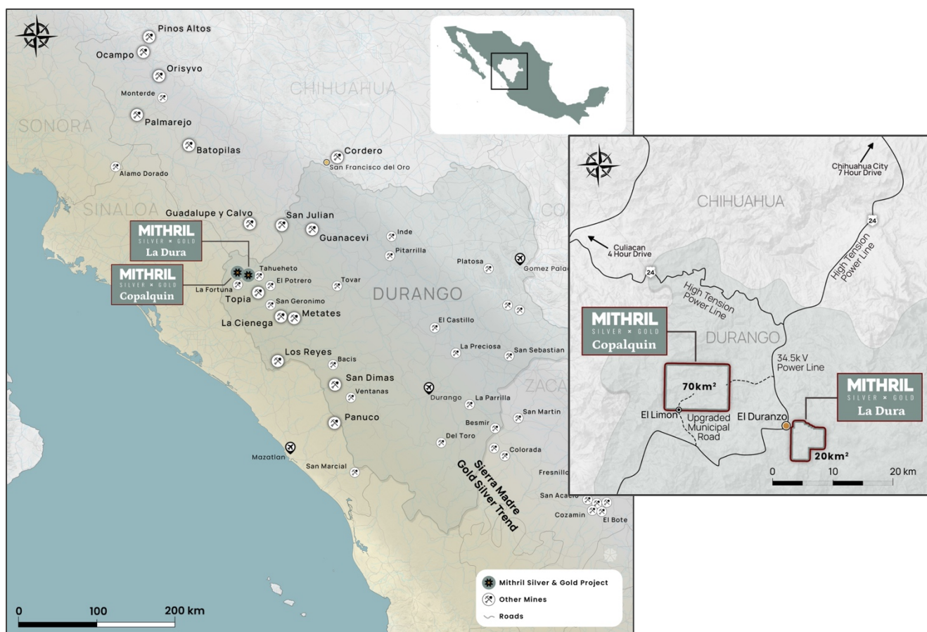
Figure 1 Mithril’s Copalquin and La Dura property locations in Durango State, Mexico

Mithril is advancing toward an aggressive exploration program in 2026, with 25,000 metres of drilling planned and up to three drills turning during the first half of the year across the Copalquin District. Upcoming work will focus on expanding known mineralized zones, testing new high-priority targets, integrating district-wide geophysical data, and continuing to advance the Company’s district-scale exploration thesis.