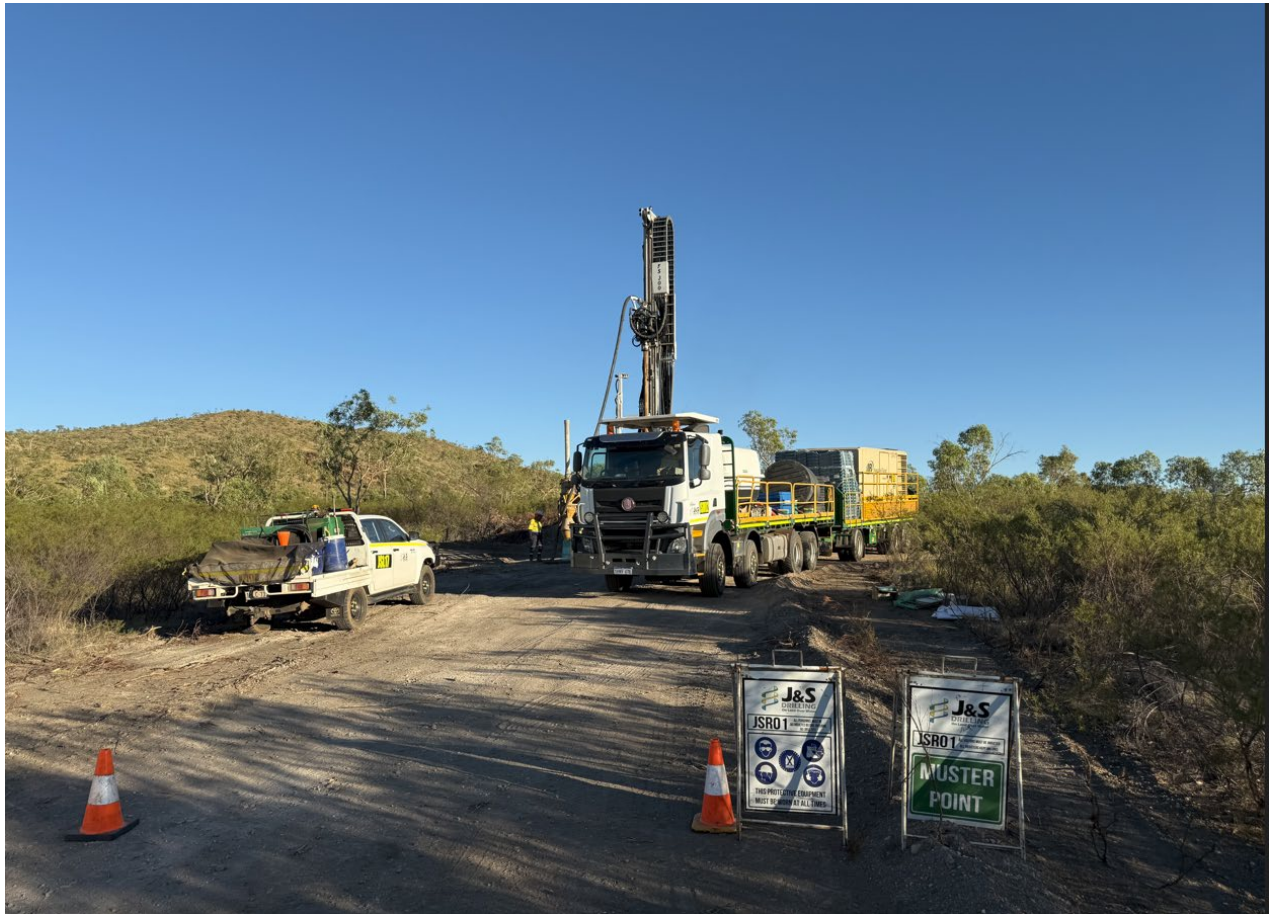
Figure 3: RC drill rig set up on 24RCDH02