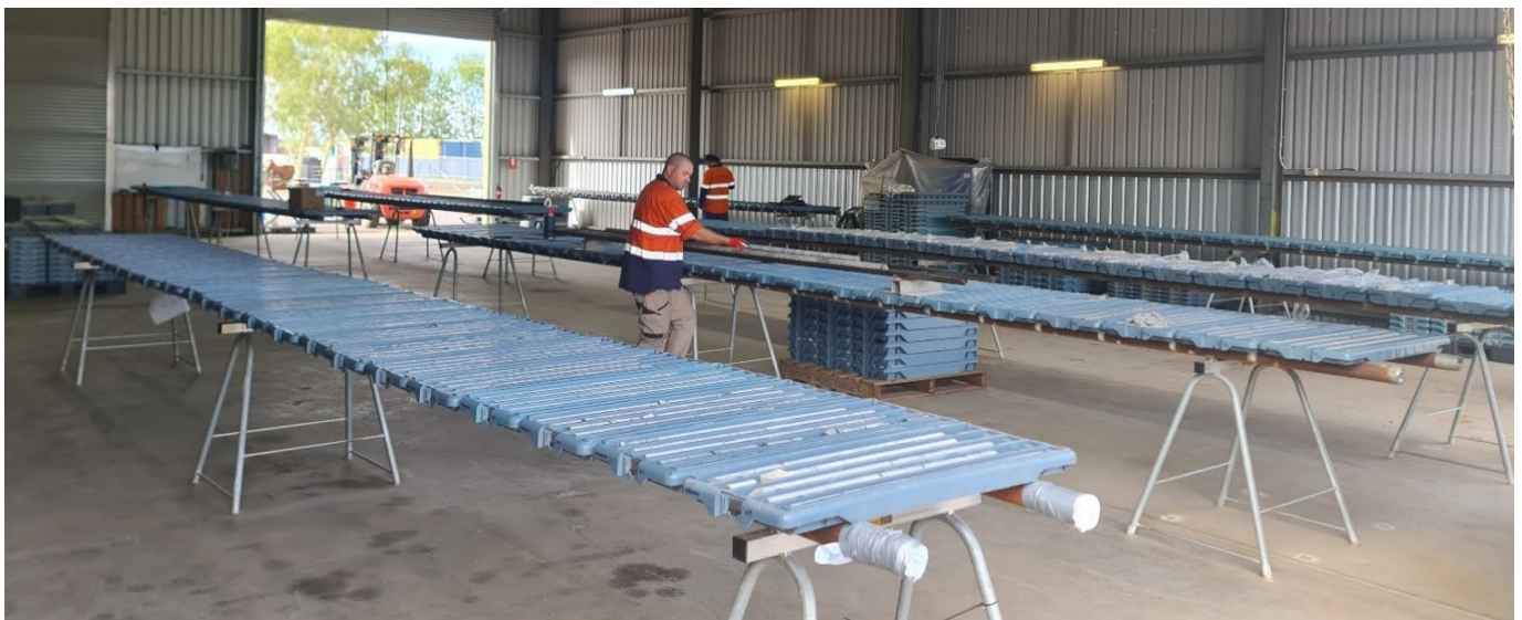
Figure 1. A busy core shed in Cloncurry where the team are processing exploration and geotechnical drill core.