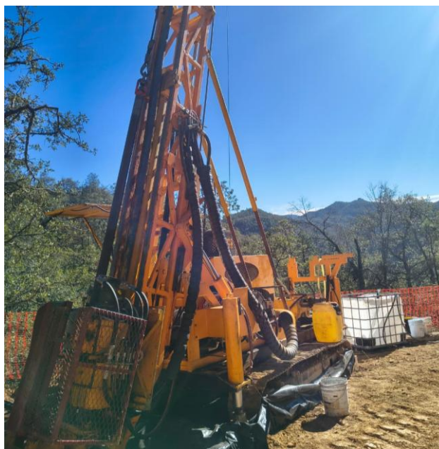
Figure 1. Photograph of the diamond drilling rig set up in the San Francisco area at Yoquivo.