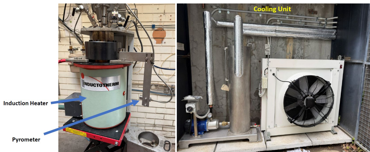
Figure 1 – Custom heating, cooling and control systems procured for TP7.

While delays were encountered in the procurement process, all of the required equipment has now been procured, installed and operated as designed, as shown in Figure 1.