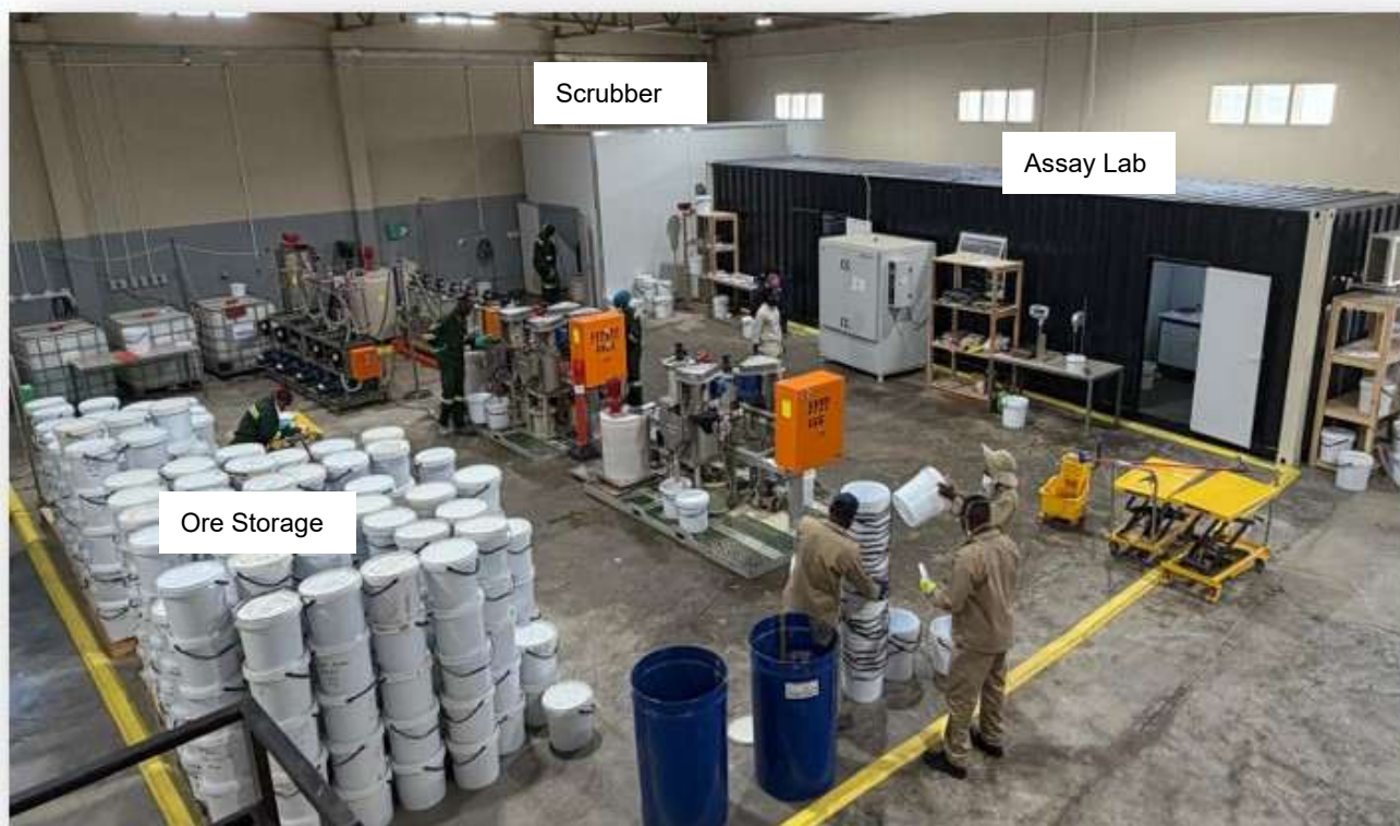
Figure 1 U-pgrade™ Pilot Plant

The bulk of the Demonstration/Pilot Plant is shown in the centre of the photo in Figure 1.