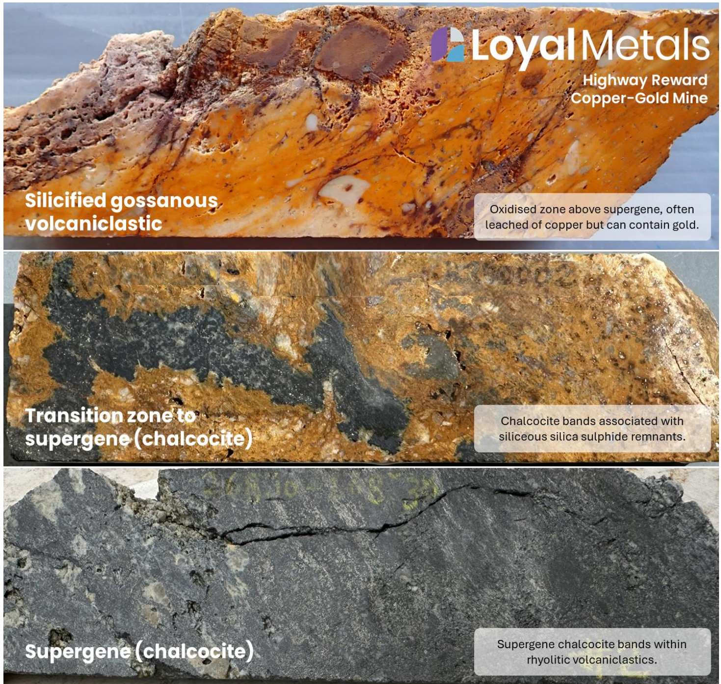
Image 1: Drill core from drillhole 25HRDD002 - Highway Reward Copper-Gold Mine – Top: Silicified gossanous volcaniclastics, oxidised zone above supergene, often leached of copper but can contain gold. Middle: Transition zone, oxidised and supergene, chalcocite bands associated with siliceous silica sulphide remnants, visual estimate 3% chalcocite, 230.1m. Bottom: Transition zone, oxidised and supergene, chalcocite bands within rhyolitic volcaniclastics, visual estimate 5% chalcocite, 236m.

Visual observations contained in the announcement should never be considered a proxy or factor of principal economic interest. Visual estimates also potentially provide no information regarding impurities or deleterious physical properties relevant to valuations.